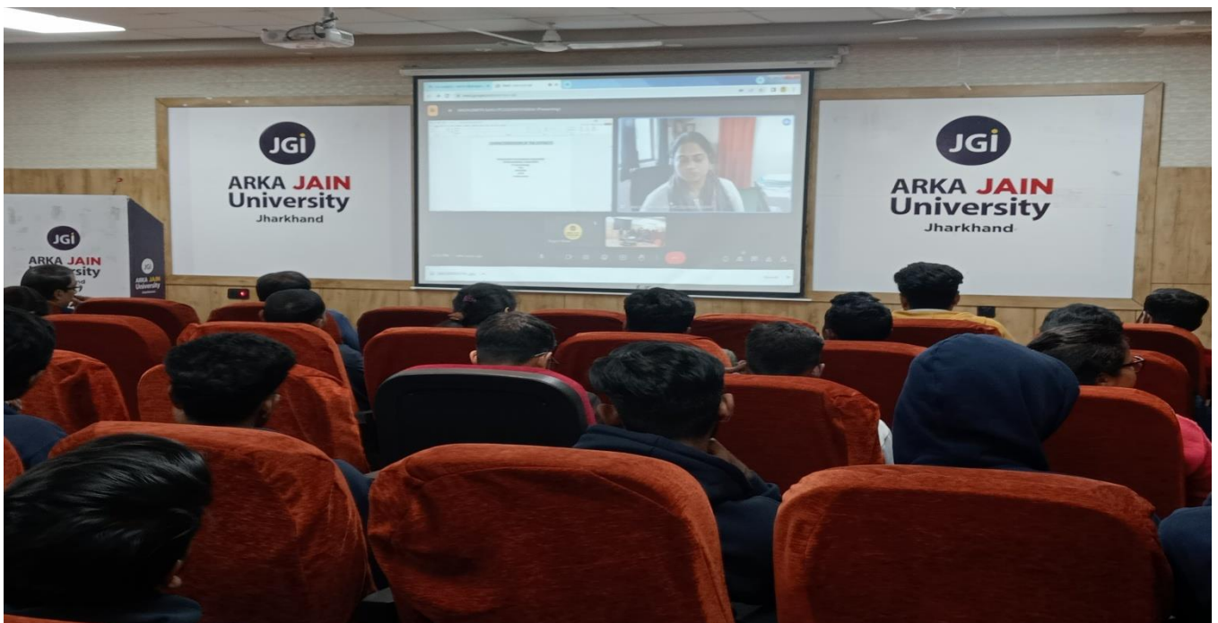
Fig. 3- Students, Research scholars Faculty members engaged enthusiastically in the session absorbing valuable insights from the expert talk