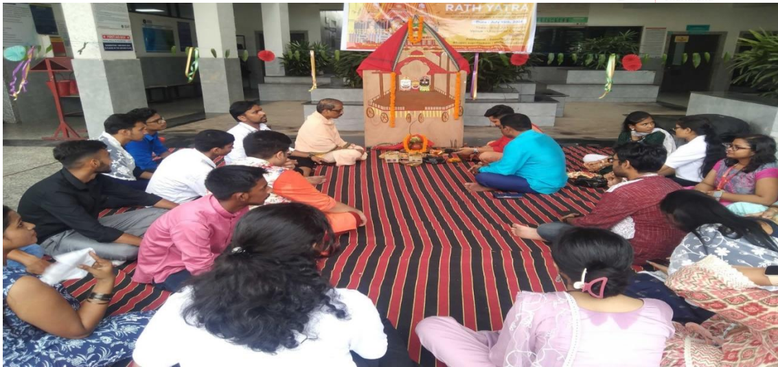
Fig.3: Dignitaries, faculty members, and students came together to pay homage to Lord Jagannath Maha Prabhu, embracing the divine spirit