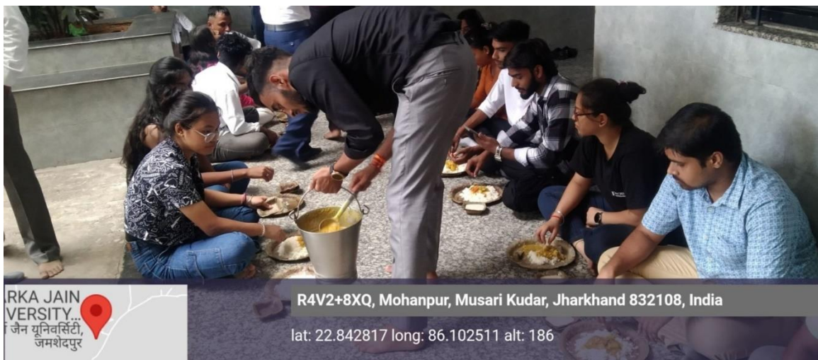
Fig.2: Students enjoying the taste of Mahaprasad