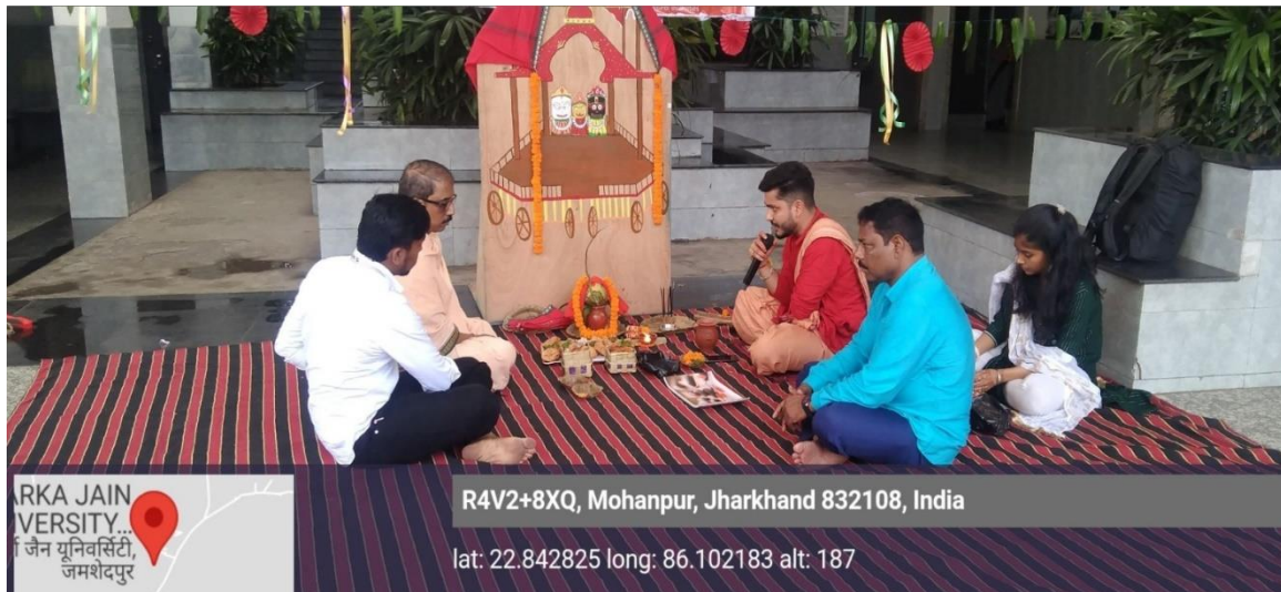
Fig.1: The Prathana session of Rath Yatra