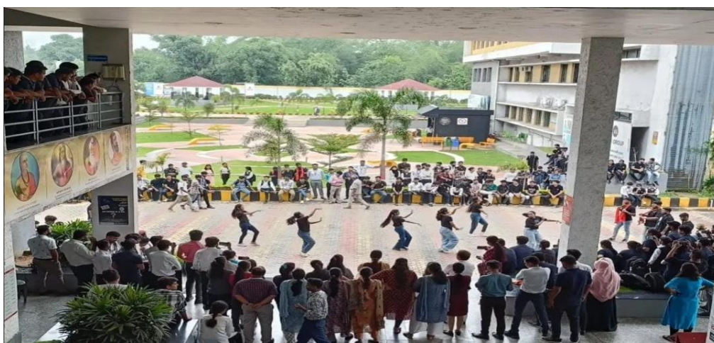
Fig.3: Students performing Flash mob as a promotional activity for Pratistha 2024