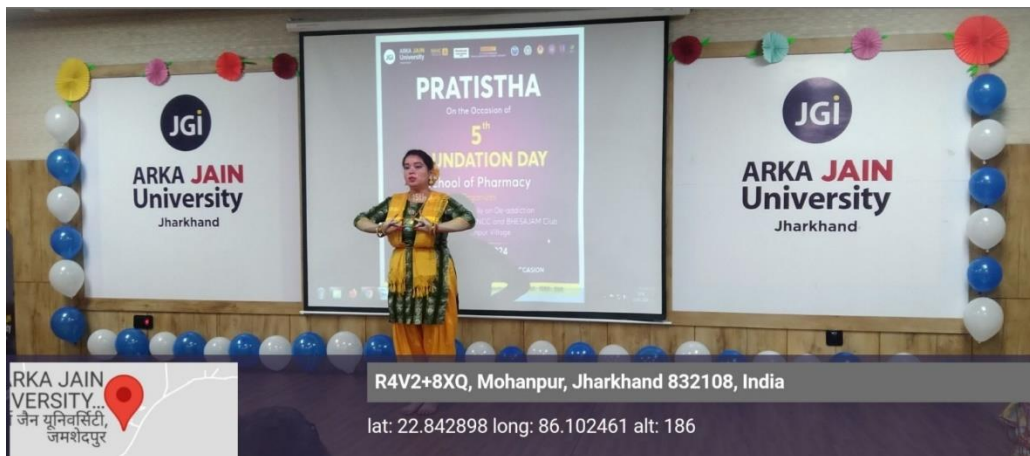
Fig.2: Ms. Shreya B.Pharm student performing the inaugural dance on the auspicious occasion