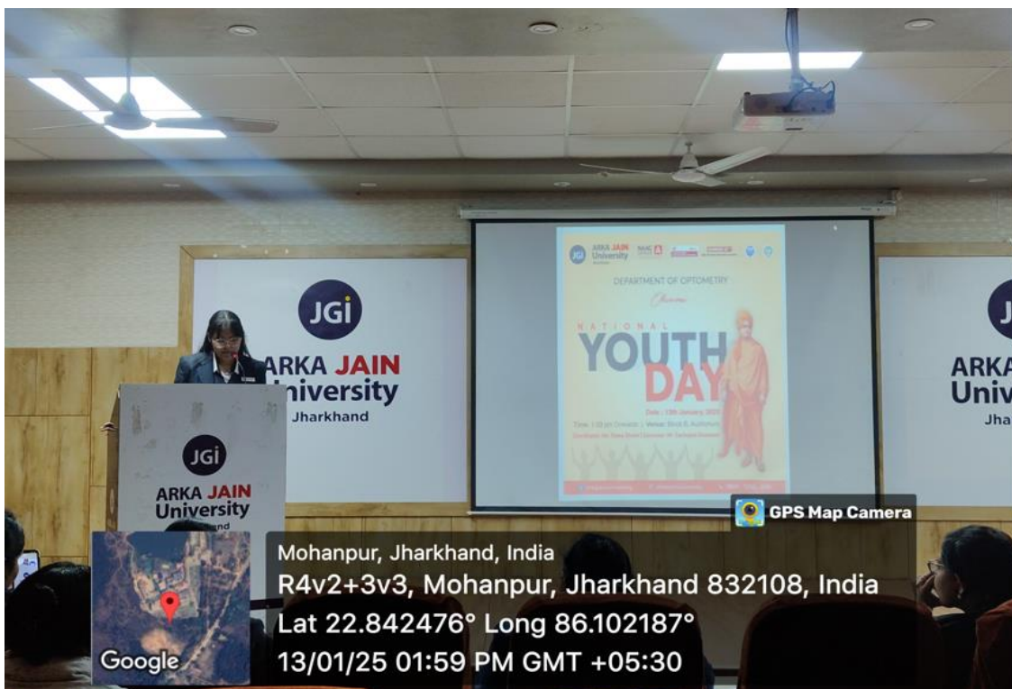
Figure 2: Presentation on Swami Vivekananda's Chicago speech.