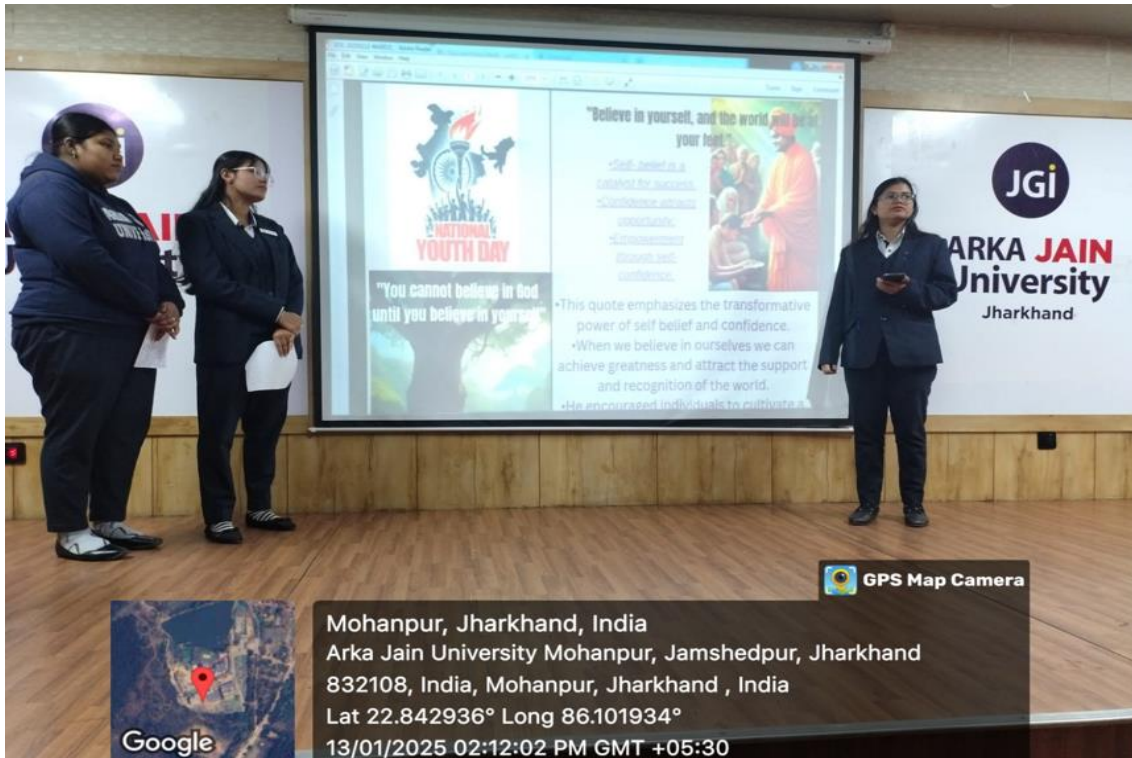
Figure 1: Students discussing the significance of National Youth Day