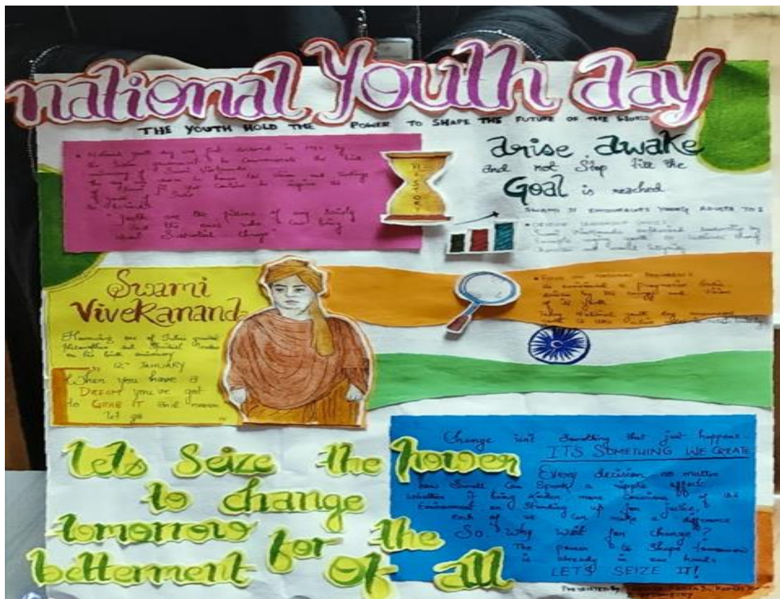
Figure 4: The poster which bagged the first prize.