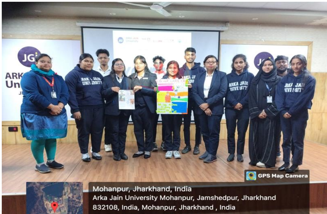
Figure 3: Participants of National Youth Day