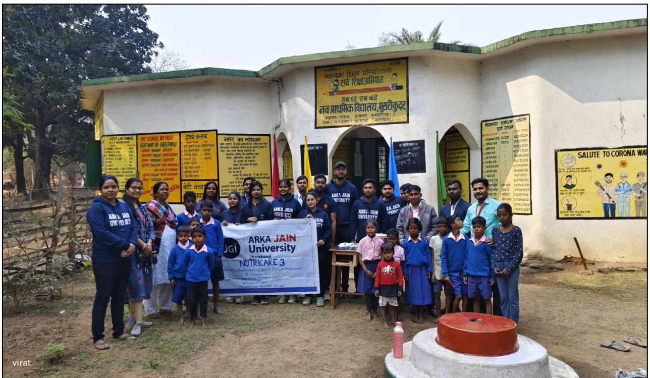
Fig.3- Student coordinators for NUTRICARE III at Musari Kudar Village along with students of school