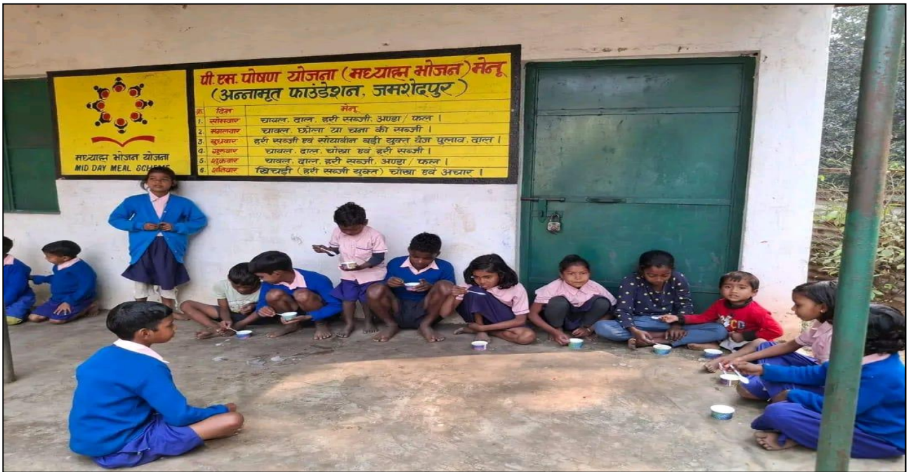
Fig.2- Children enjoying the taste of curd pudding with nuts