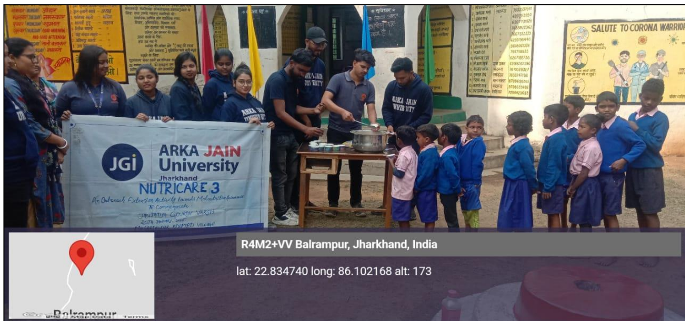
Fig. 1- Geotag glimpses of “NUTRICARE III_ Awareness Against Malnutrition