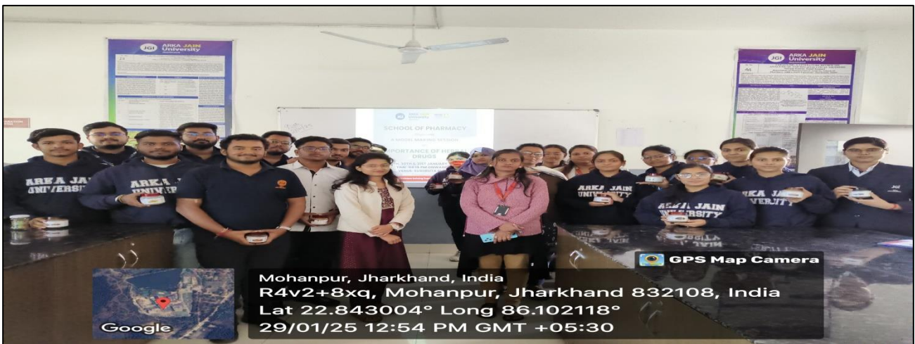
Fig. 1-Geotag glimpses of Participants with their prepared models