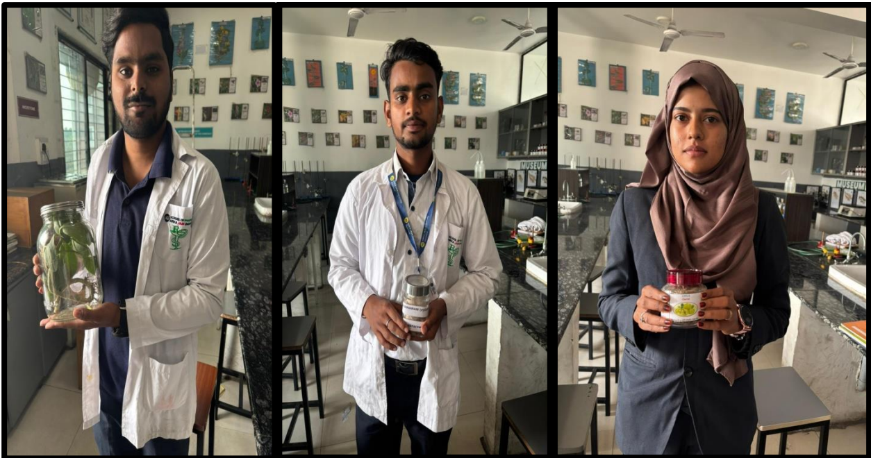
Fig.2-Students executing models prepared by them selves