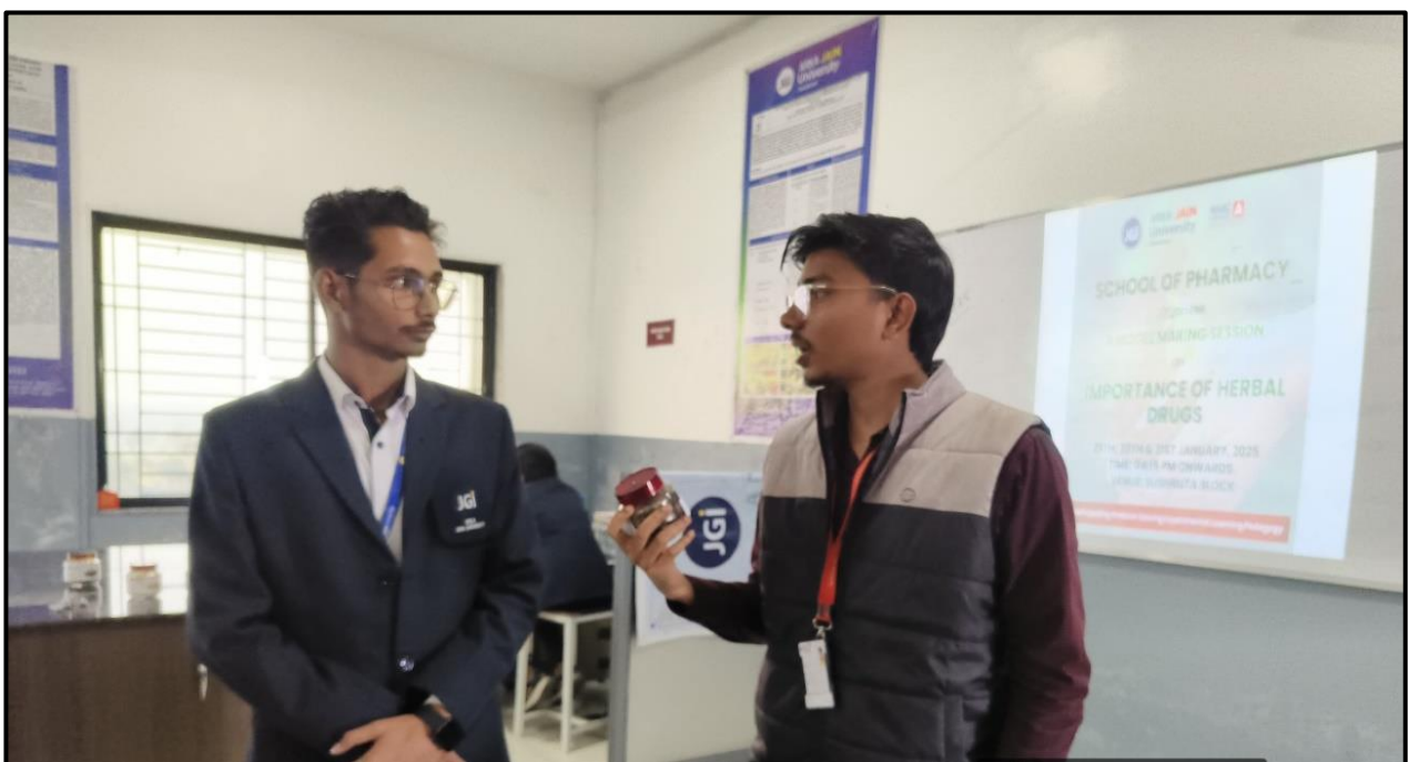
Fig.3-Interactive session between Teacher and students explaining the therapeutic as well as the pharmacognostic features of the crude drugs