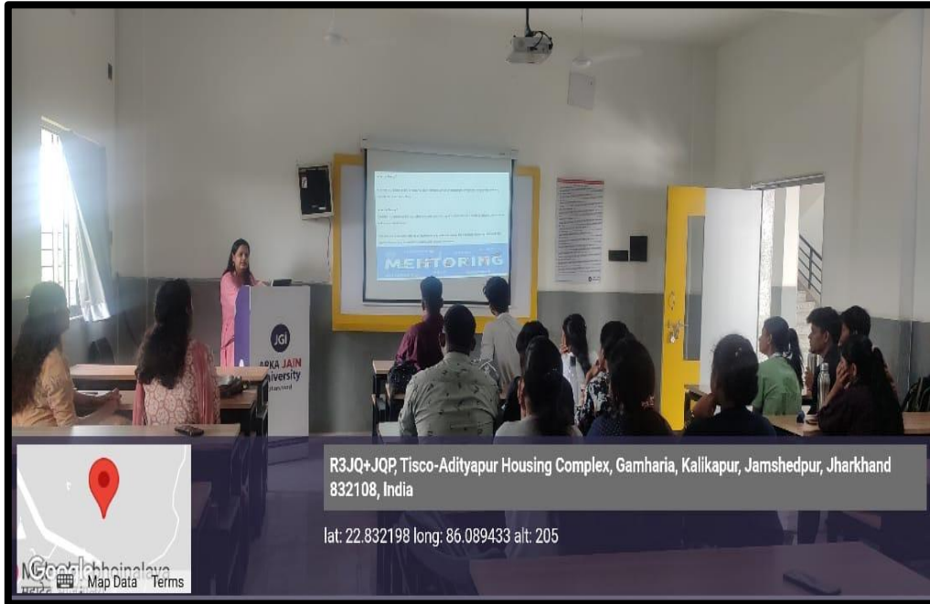
Fig. 2: Students attending the session