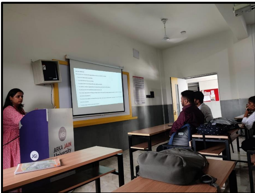
Fig. 3 – Addressing students' queries on mentorship