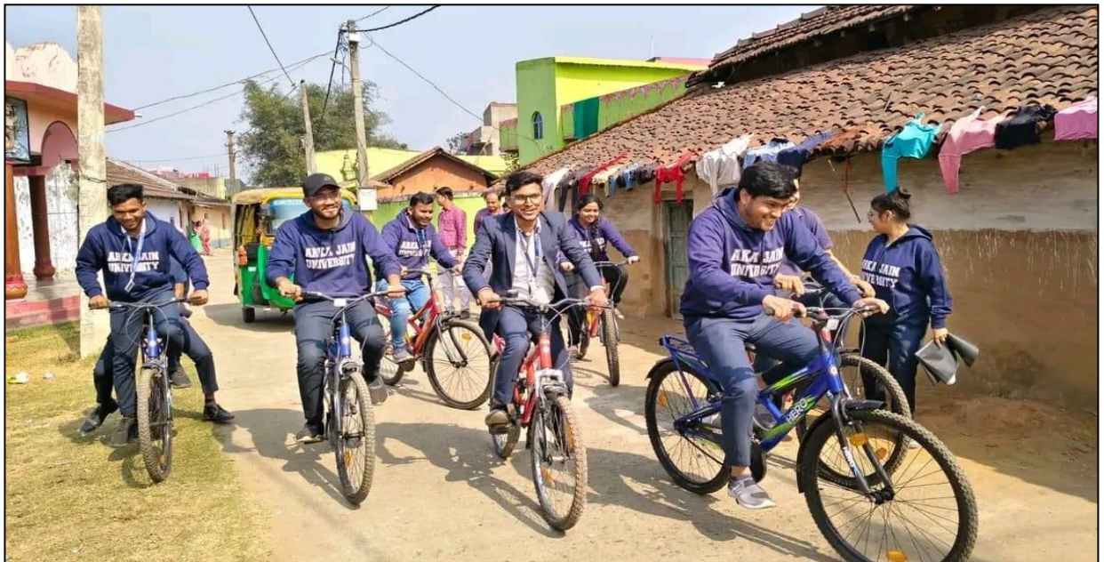
Fig. 2- Stronger with Every Step: The Marathon Momentum