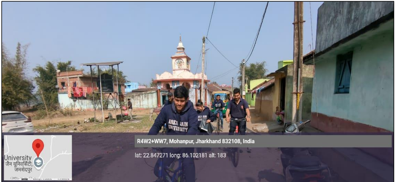
Fig. 1: Geotag glimpses of “HUM SIKANDER IV_A Mini Cycle Marathon”