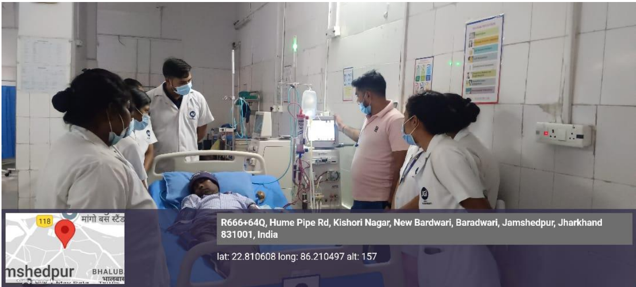
Fig 3: Expert staff explaining the students regarding operational of the machine