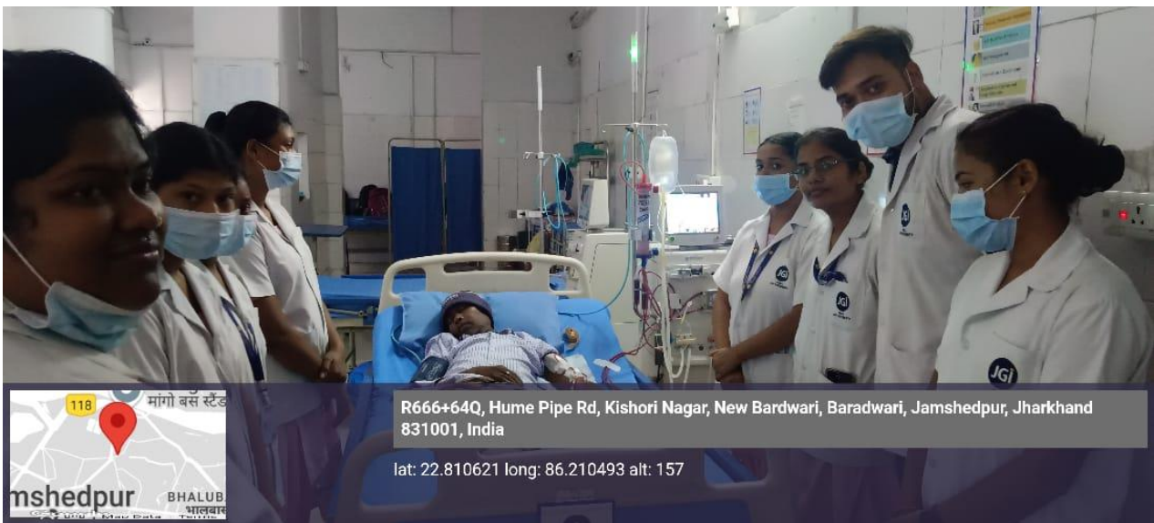
Fig 2: Students interacting with the client