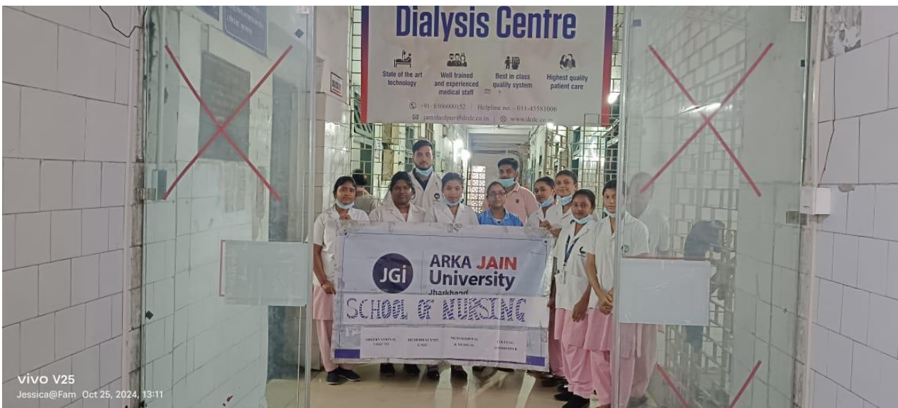
Fig 4: Group Snap of the Observational Visit to Haemodialysis Unit