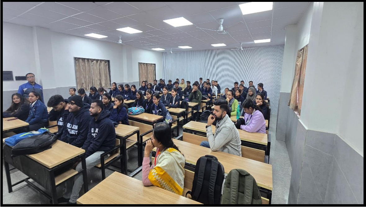
Figure 4: Image of students attending session- Guest Session