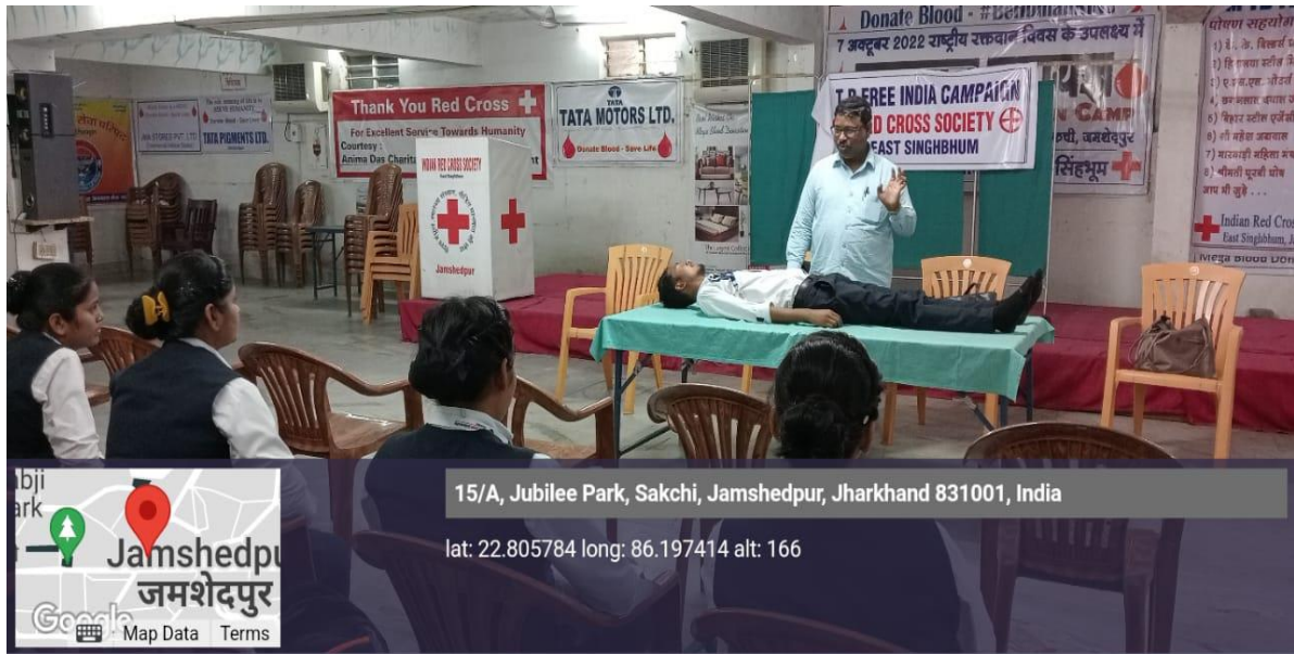
Fig 1: Demonstration Regarding CPR/BLS by Society Member