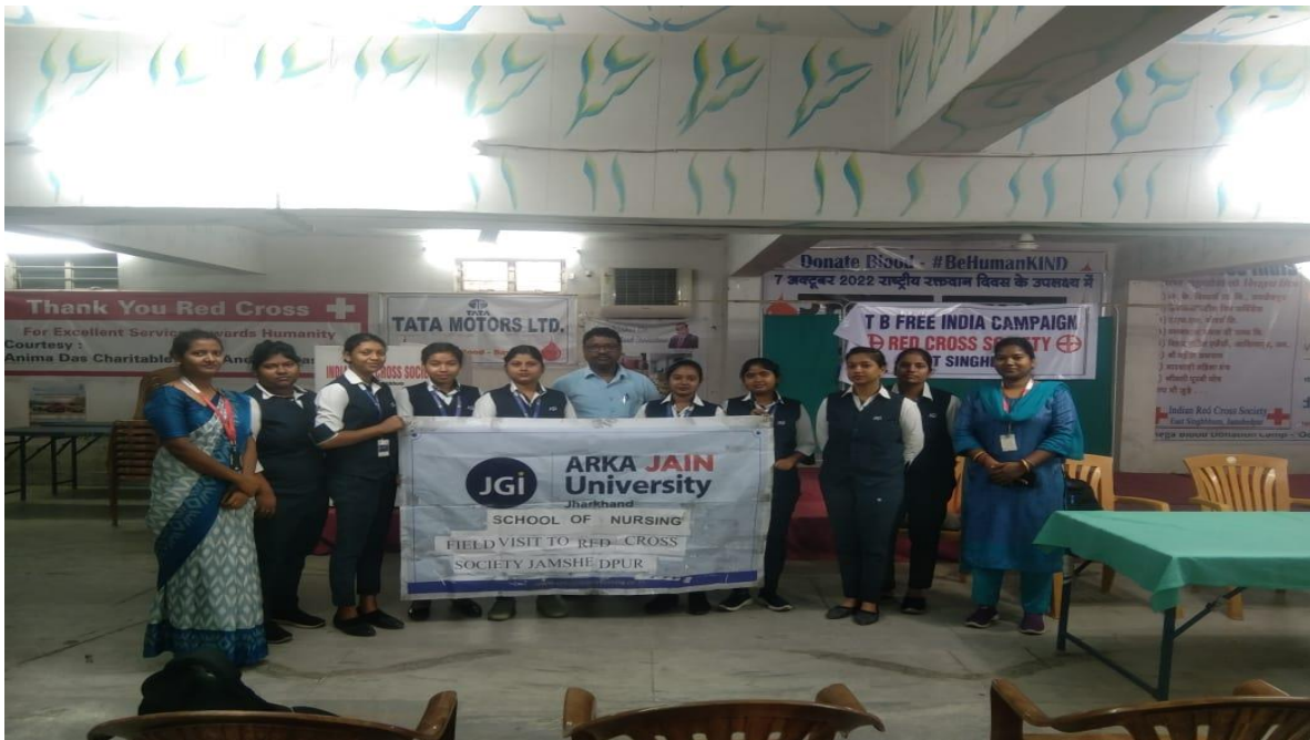
Fig 4: A Group Snap of visit to RED CROSS SOCIETY