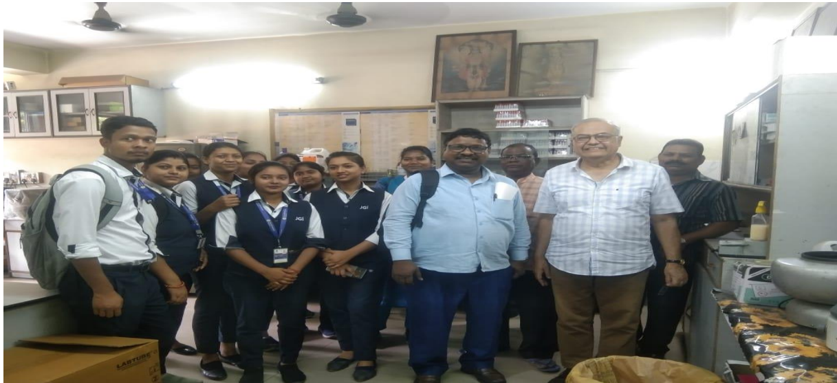
Fig 3: A visit to LAB