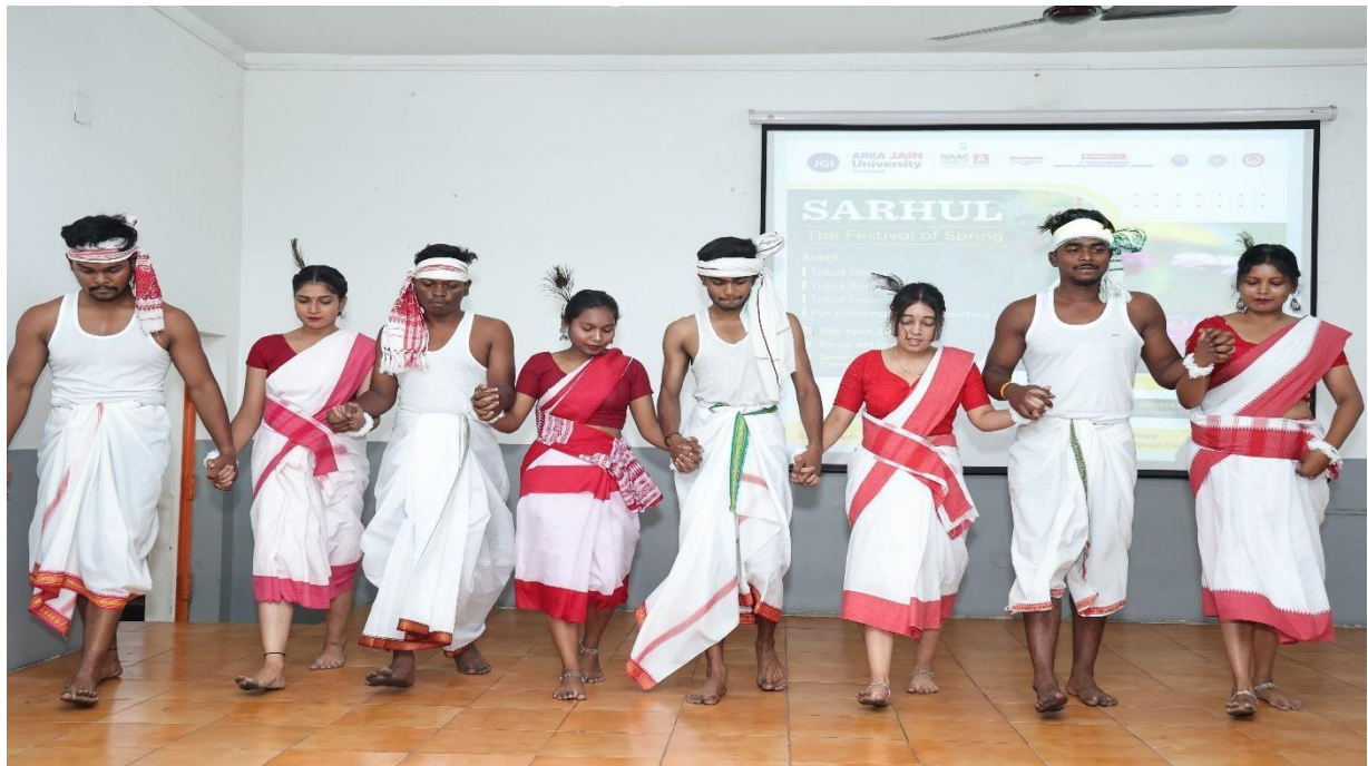
Fig 5: Students of B.Sc. Biotechnology 4th semester presented a Tribal Dance and Tribal Fashion show