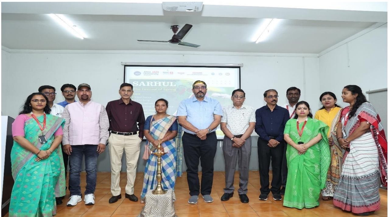
Fig 4: Lamp lightening: All the dignitaries and faculties of ARKA JAIN UNIVERSITY along with the chief guest