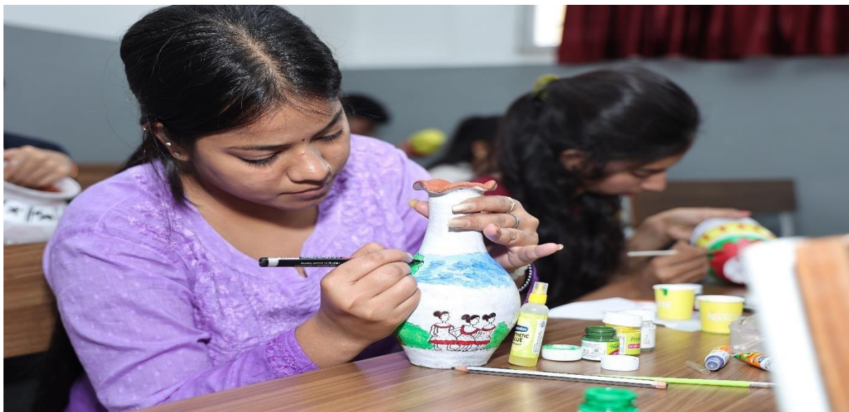
Fig 6: Students from different departments of AJU participated in Pot Painting/Surahi Painting Competition