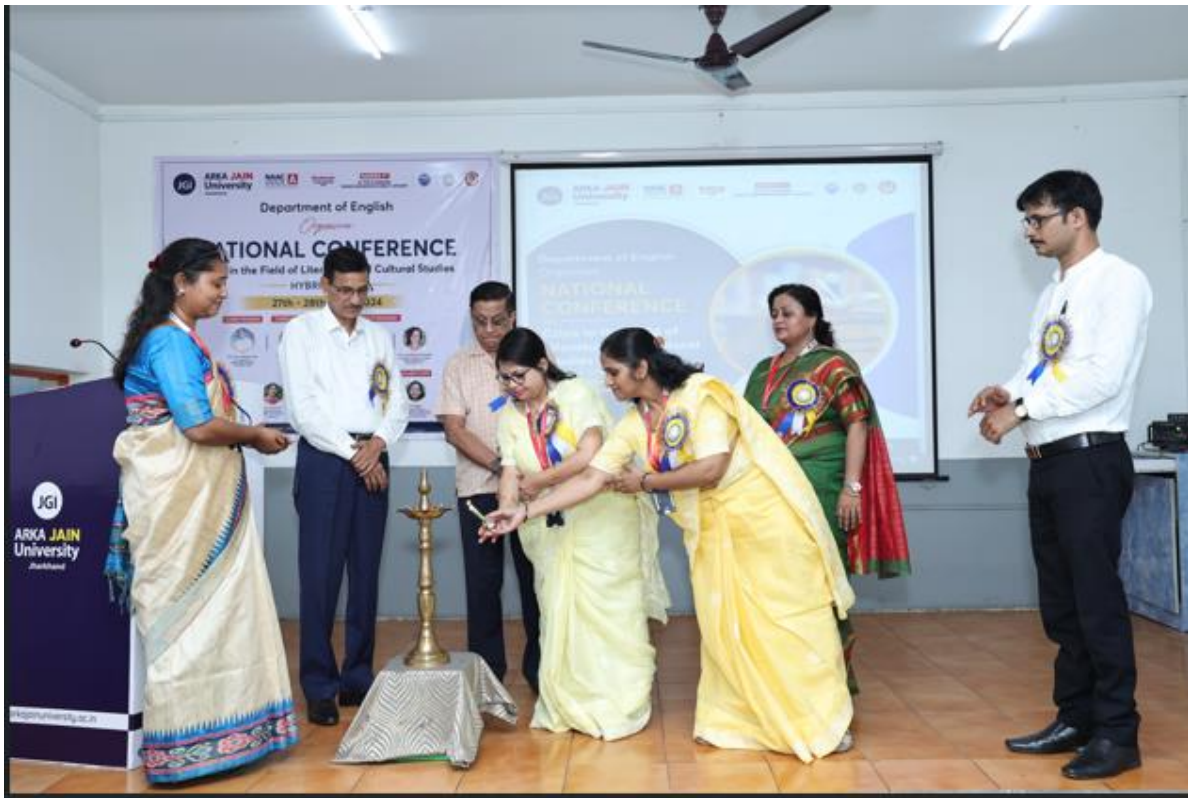
Fig 1.1 Inaugural ceremony of the conference