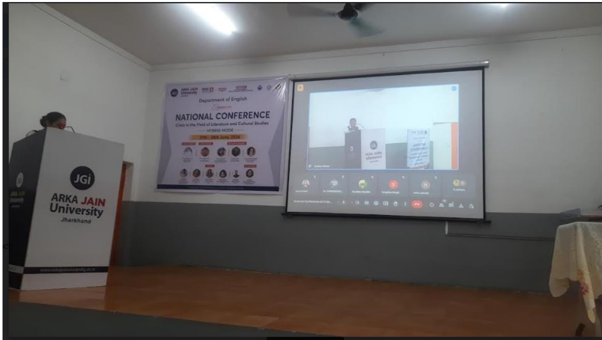
Fig 1.8 Students of ARKA JAIN University presenting papers for the Conference