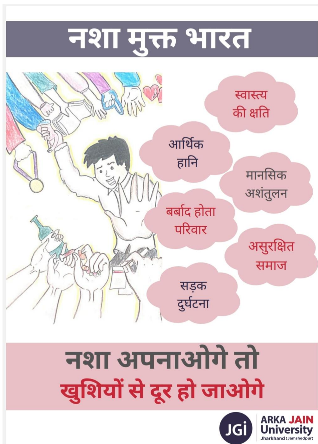
Figure 1: Poster of Nasha Mukta Bharat Bhiyan