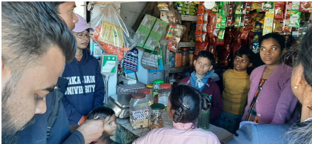
Figure 2: Students interacting with shopkeepers and purchasers