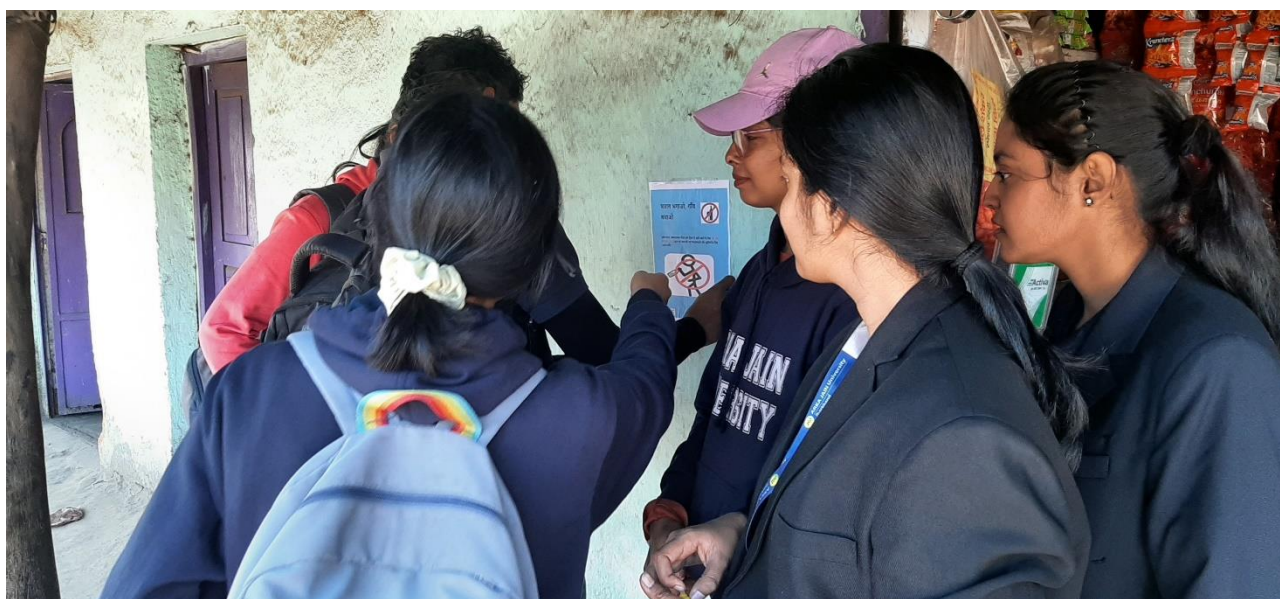
Figure 3: Students sticking posters on Wall