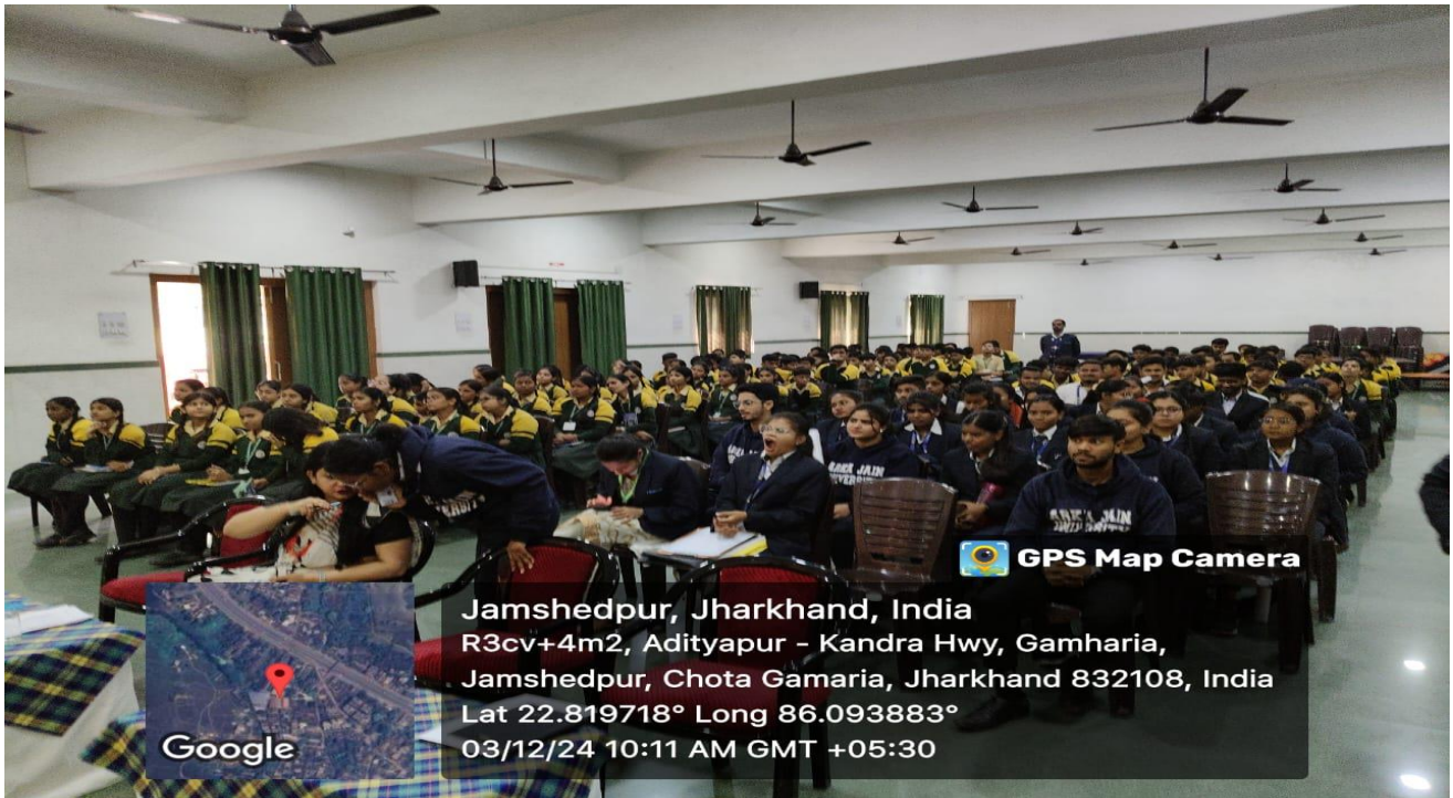
Fig 5: Students participating in the event