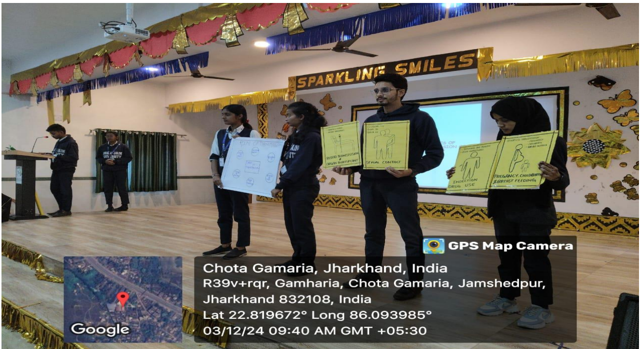
Fig 4: Nursing Students displaying the AV AIDS