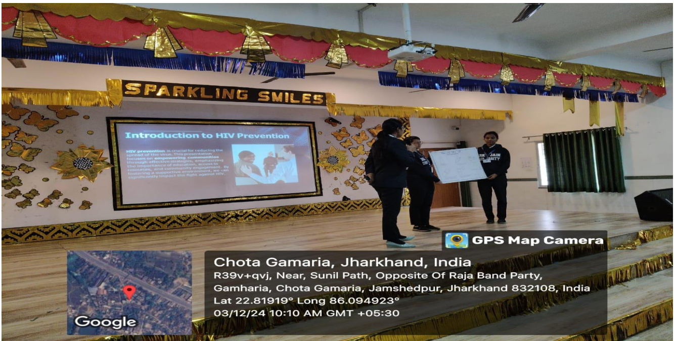
Fig2: Nursing Students briefing about the HIV AIDS