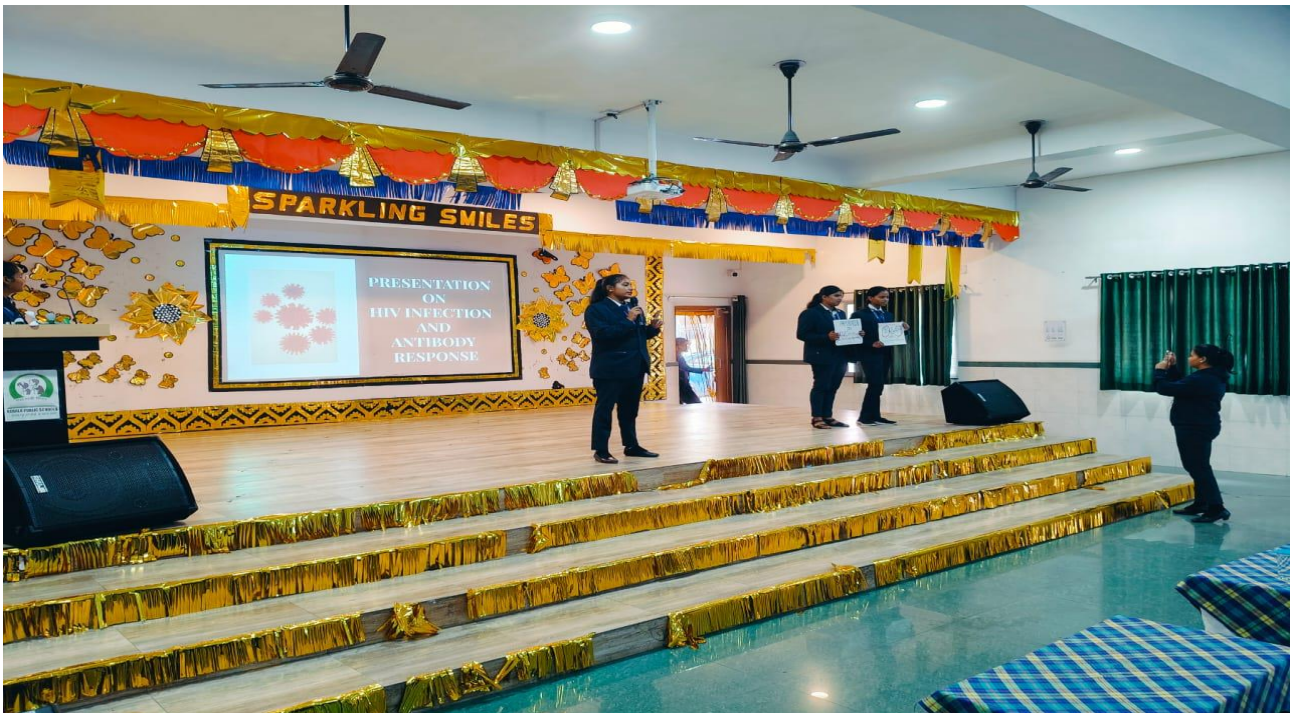
Fig 3: Nursing Students explaining about the prevention of HIV AIDS