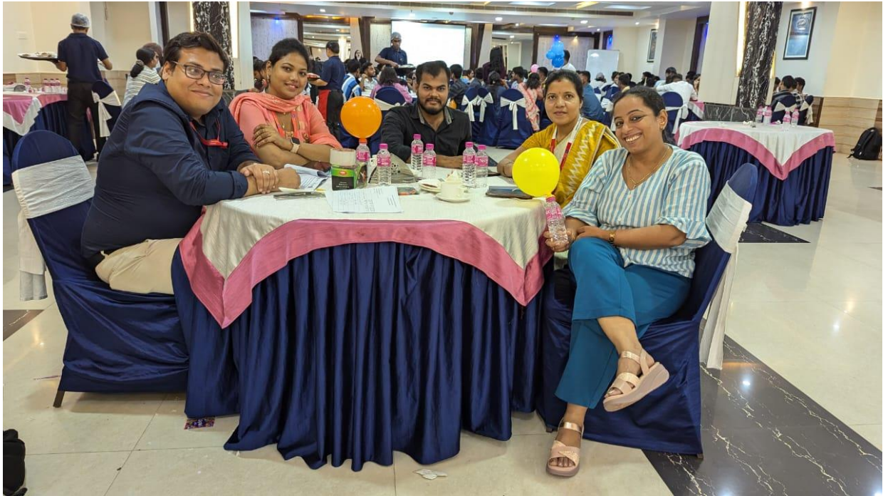
FIG 1: Group photo of convenor and co-ordinators