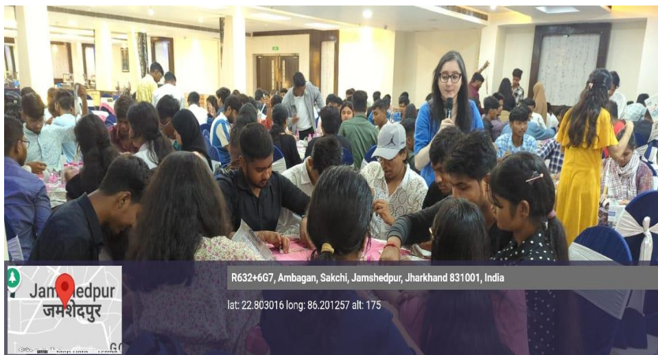
FIG 4: Chain making challenge