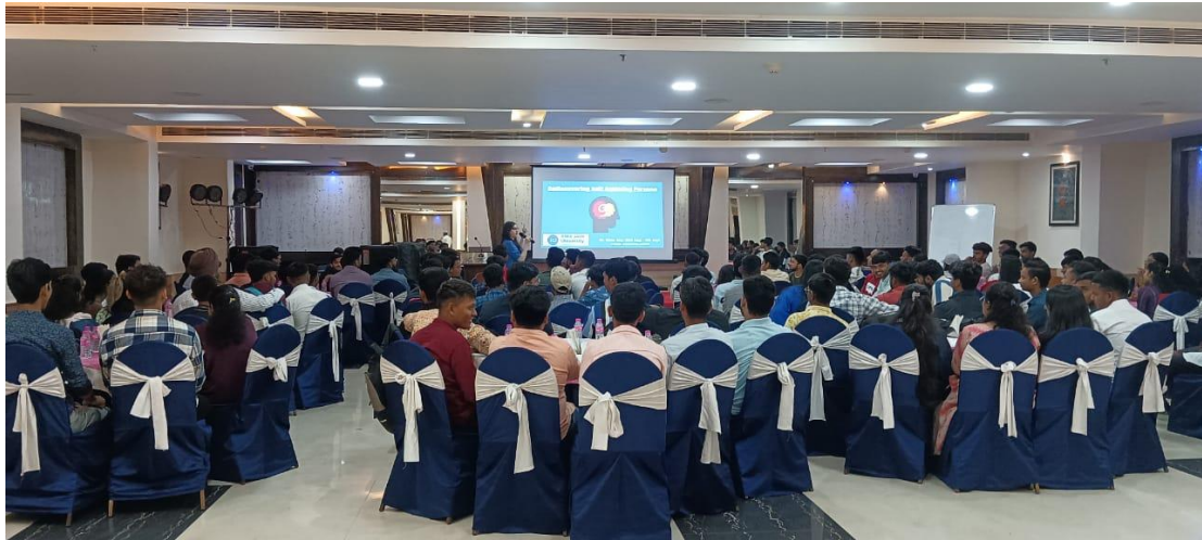
FIG 3: Students attentively attending the session