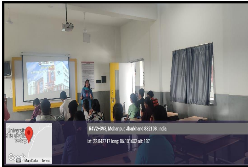
Figure 2: Faculty interacting with students about the session