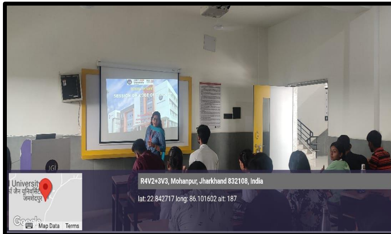
Figure3-Students queries about the session