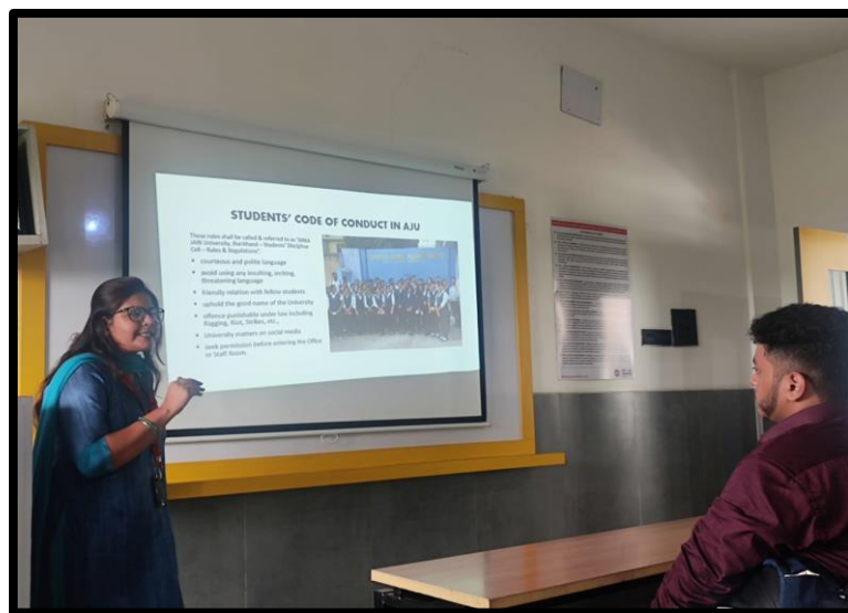
Figure4-Explaining about Code of Conduct followed in college