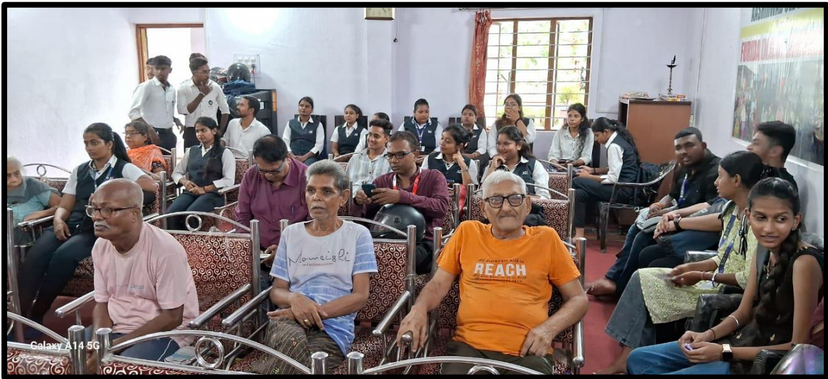
Figure 4- Senior Citizens interacting with students