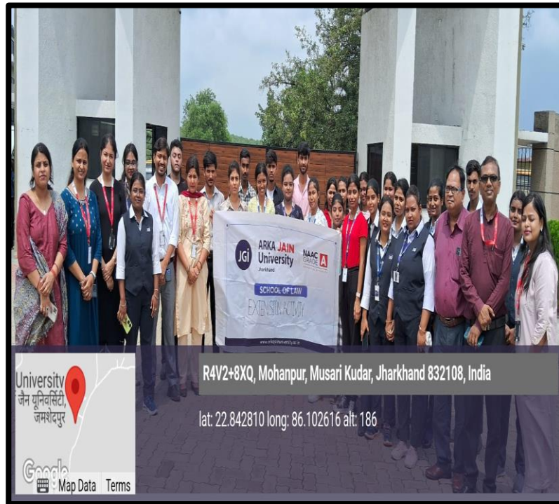
Figure 2- Students and Faculties with banner