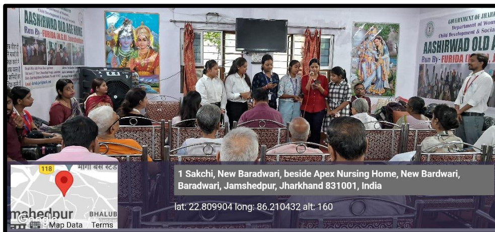
Figure3- Students singing a song at old age home