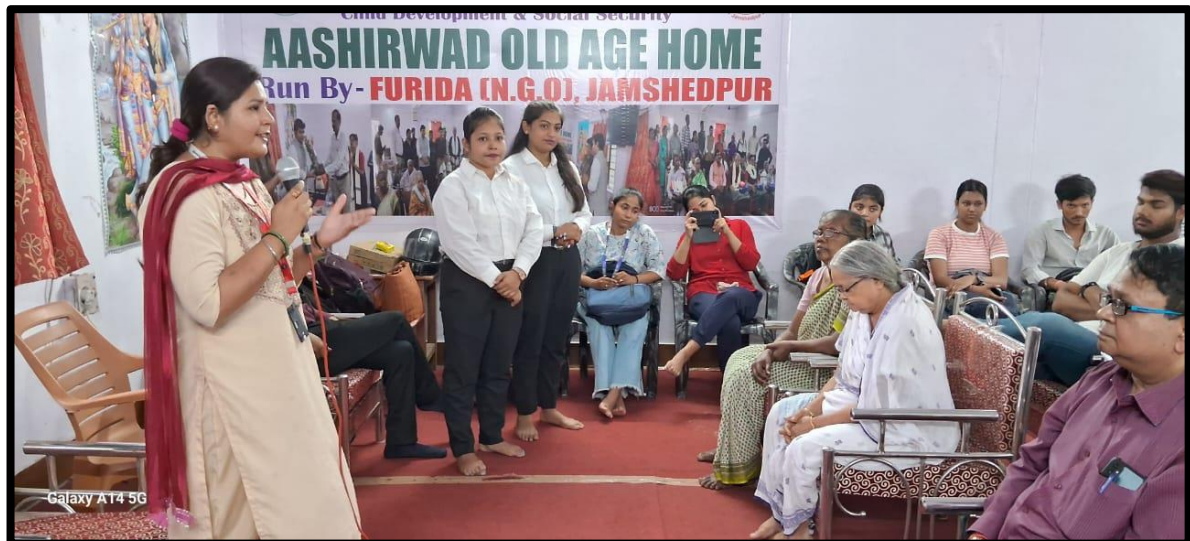
Figure 5- Faculty presenting a speech for them