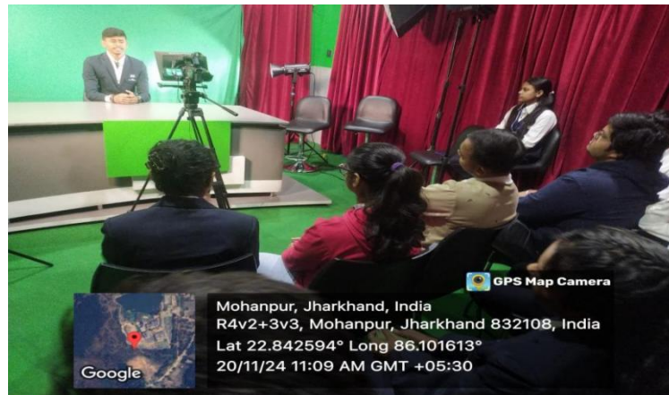
Figure 3: Students practicing news presentation in JMC studio