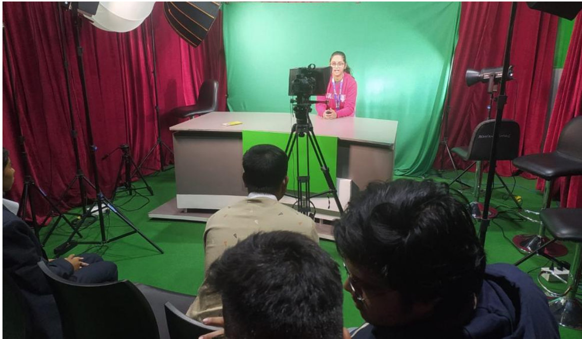
Figure 5: Student practicing and enhancing news presentation skill