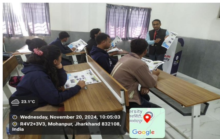
Figure 4: Students listening to the faculty about the importance of developing newspaper reading habit