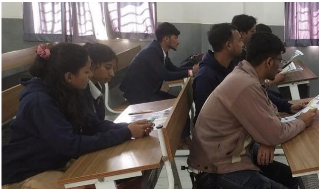
Figure 6: Students reading newspaper headlines and news as a part of activity on National Press day