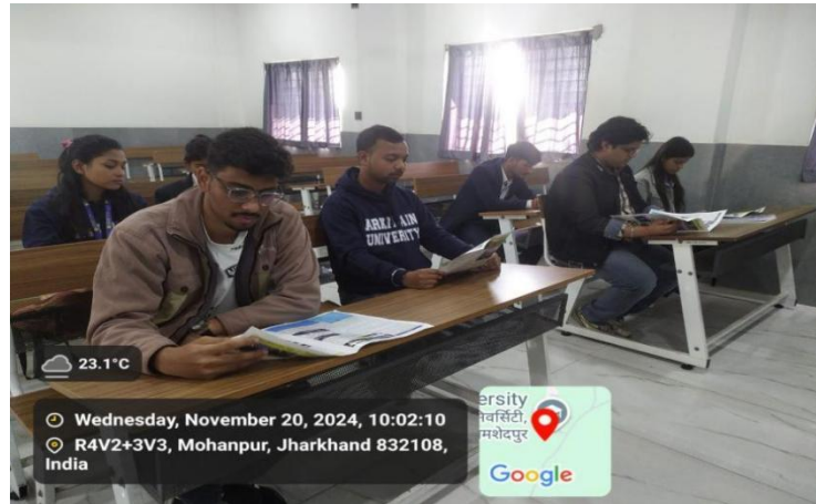
Figure 2: Students reading newspaper on National Press day