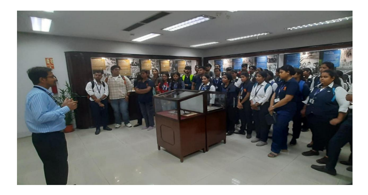
Figure 3: Students during educational visit getting brief about the journey of the Tata Family and its industrial development.