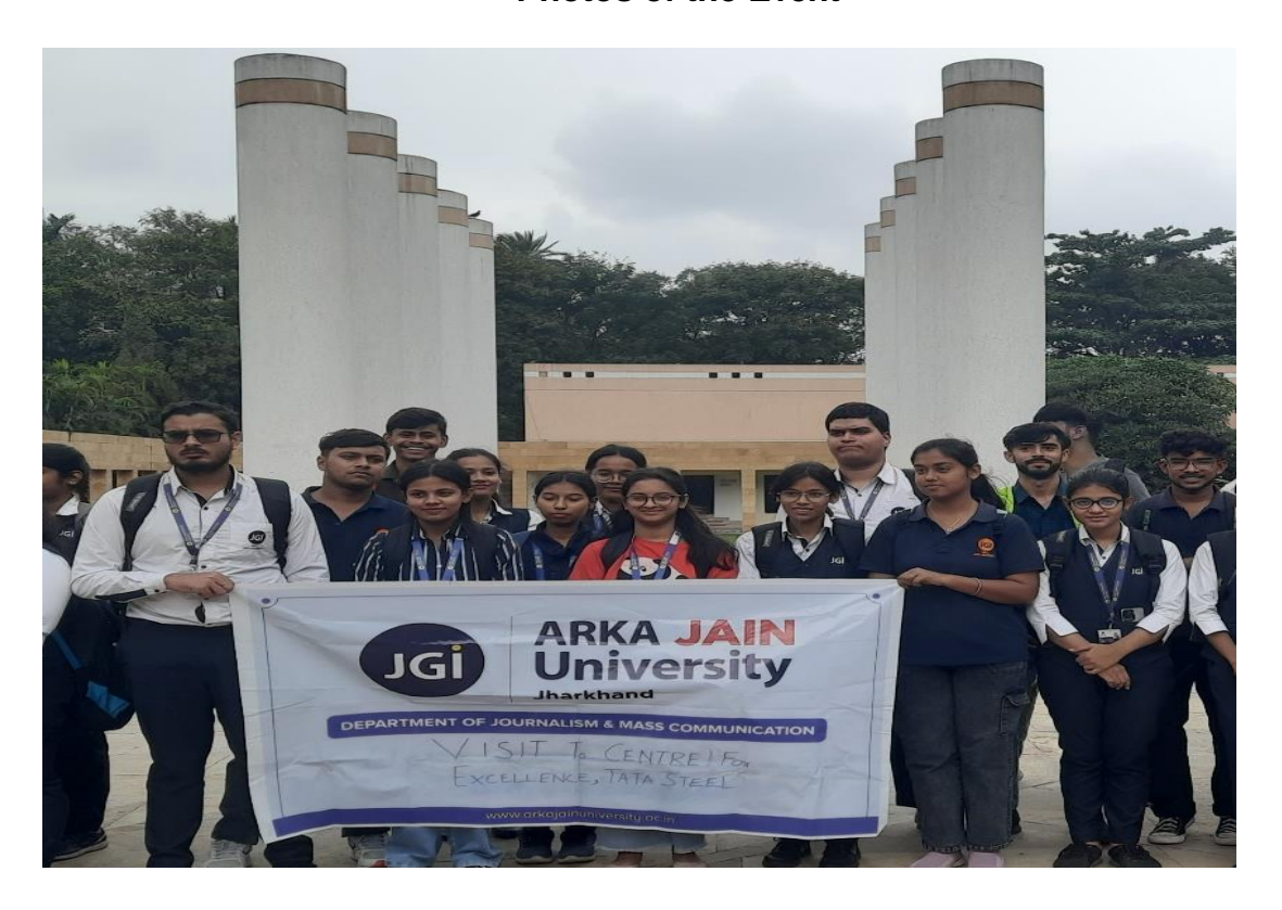
Figure 2: Students attending the educational visit to Centre for Excellence and TATA Geological Park