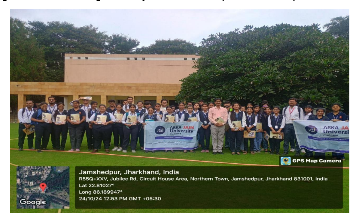
Figure 5: Students during Educational visit to Centre for Excellence and TATA Geological Park