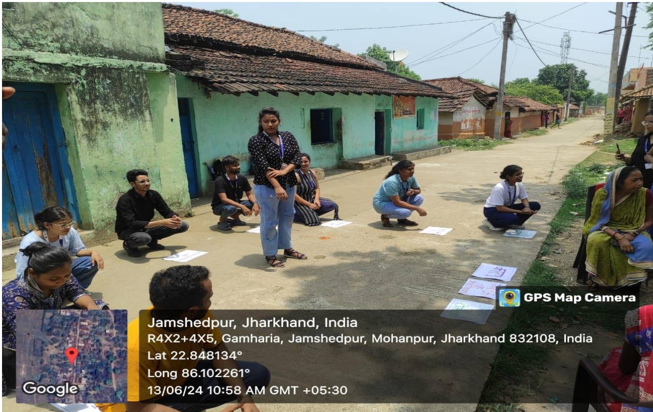
Photos of the Event: Nukkad Natak performed by the Nursing Students depicting the Treatment & Management of Hypertension