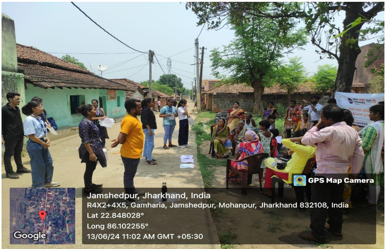
Photos of the Event: Nukkad Natak performed by the Nursing Students.