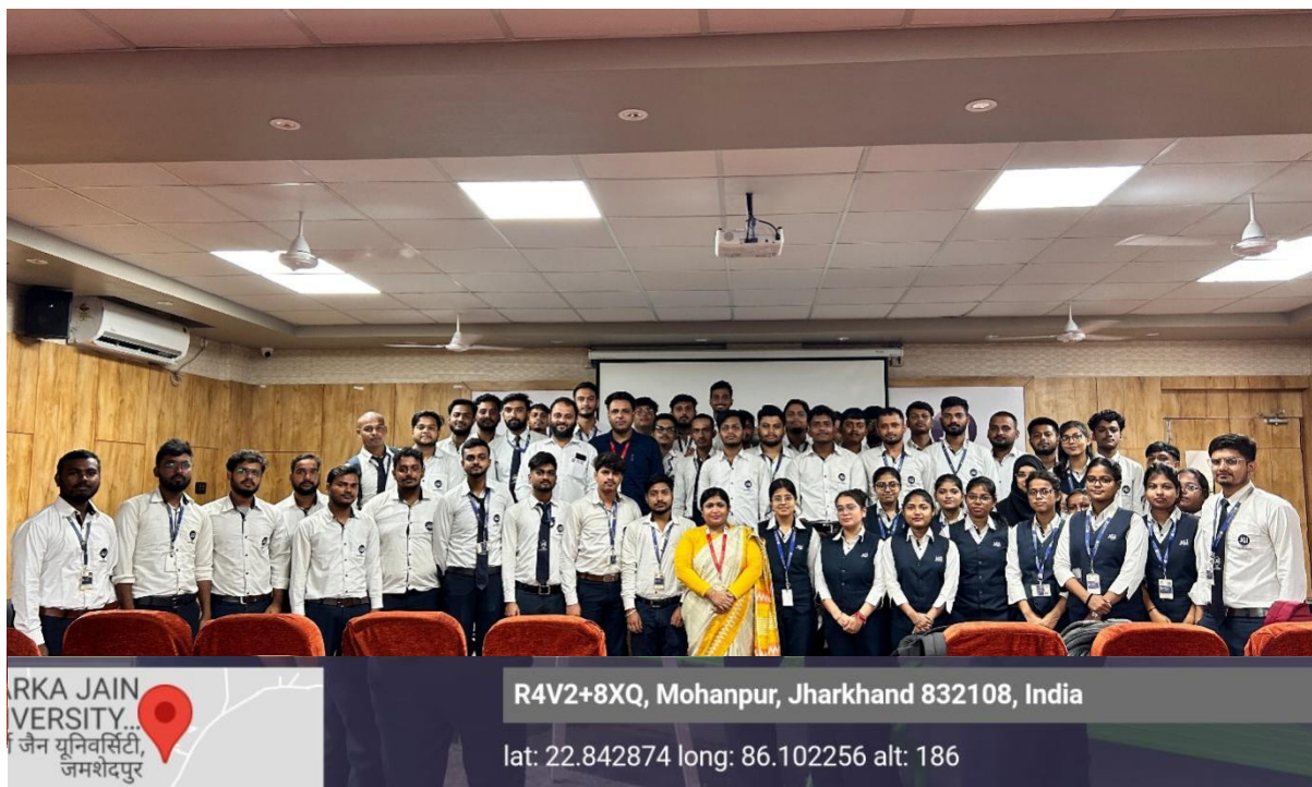
Fig 1. B.Pharm final year students who attended the session on career counselling