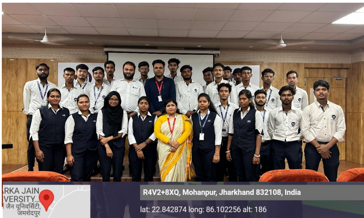
Fig 2. D.Pharm final year students who attended the session on career counselling