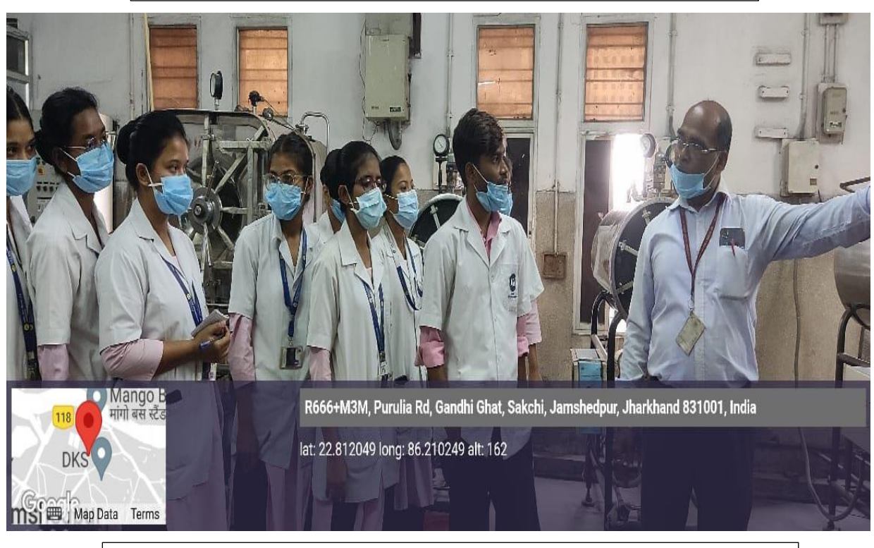
Photo of the Event: Students having interactive session with the In-charge