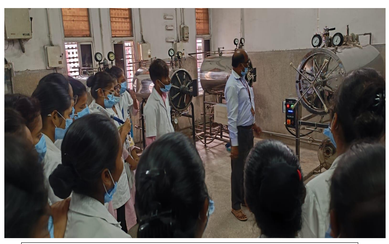
Photo of the Event: In-charge of CSSD briefing the process of Autoclaving