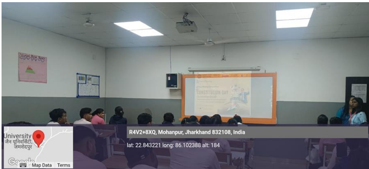
Photo of the Event: Waiting for result declaration of the Essay Writing Competition