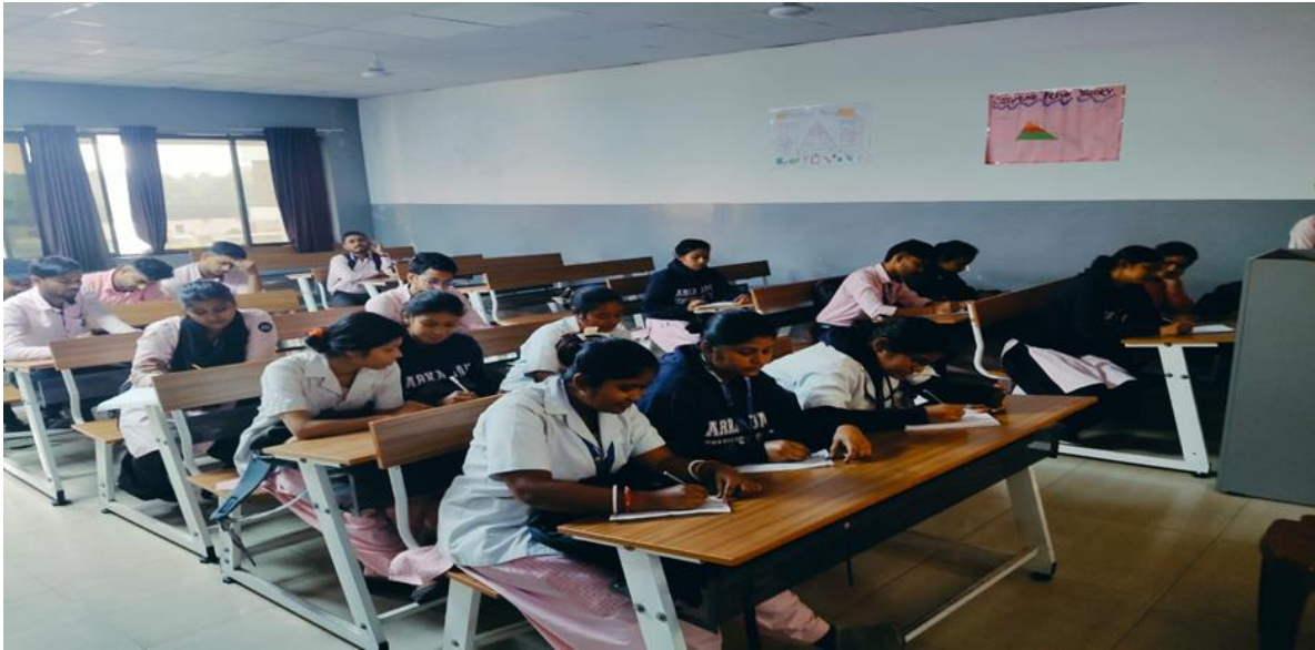
Photo of the Event: Students participating in Essay Writing Competition