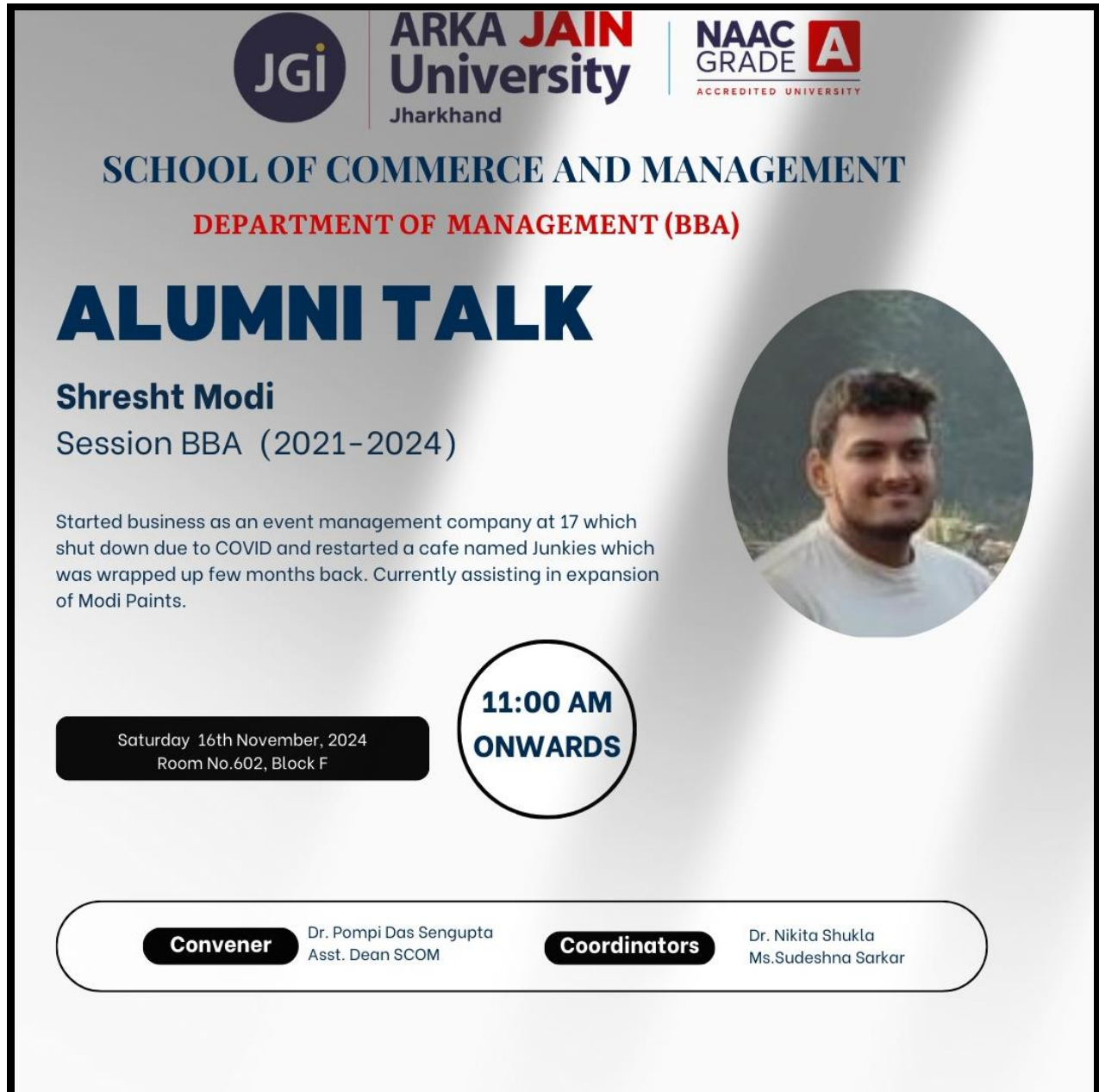
Figure 1: Poster of the Event- Alumni Talk