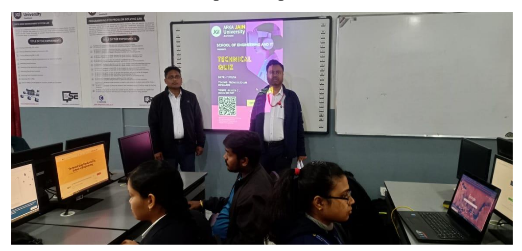
Fig 2: Session Going On