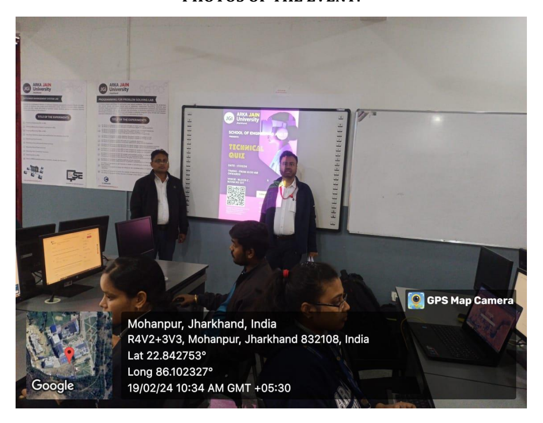
Fig 1: Geo Tag Photo