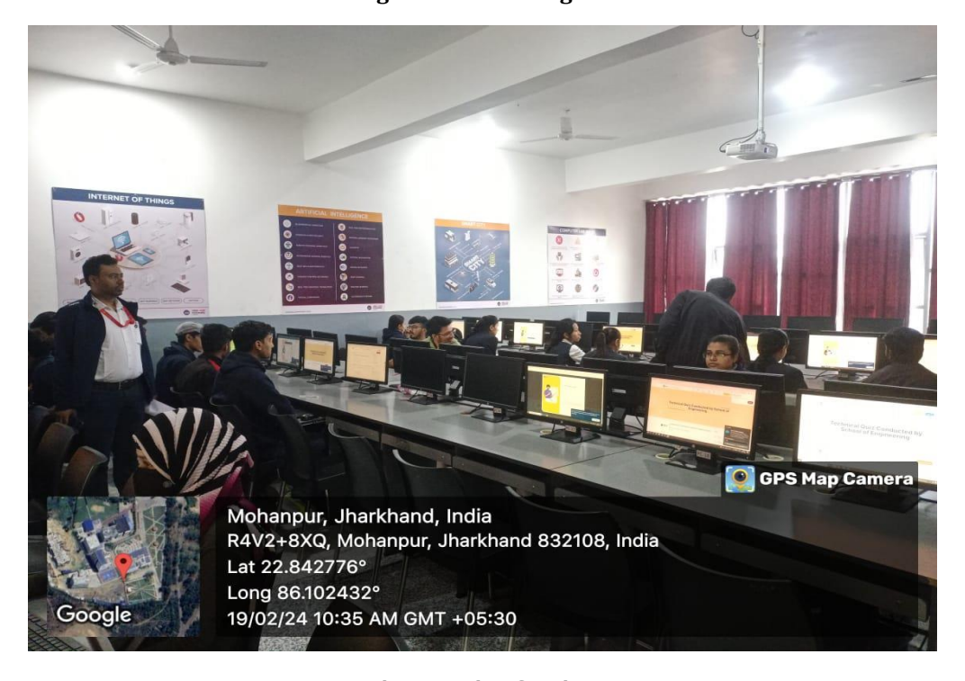
Fig 4: During Session