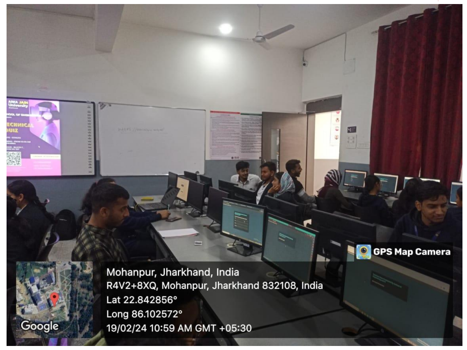
Fig 3: Session Going On