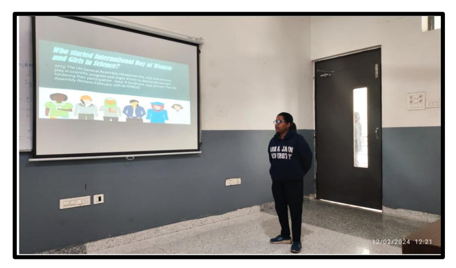
FIG 2: PPT PRESENTATION