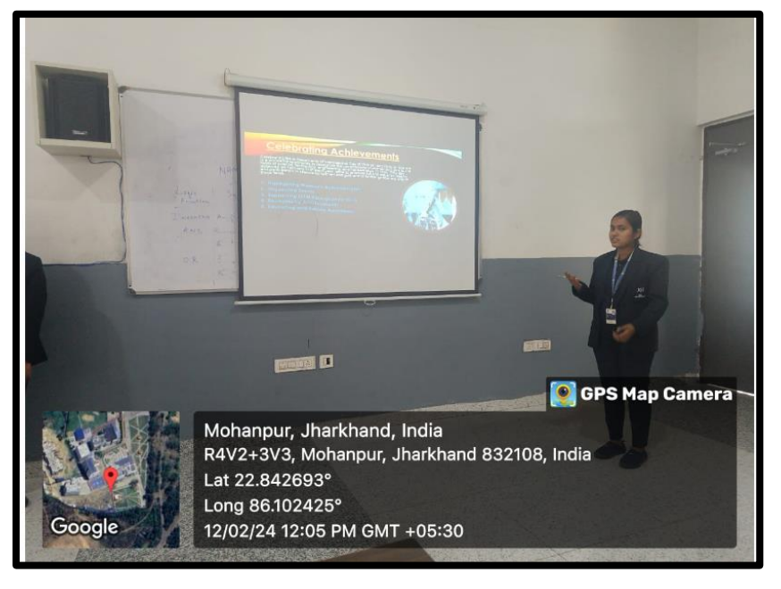
FIG 1: GEO TAG PHOTO OF INTERNATIONAL DAY OF WOMEN AND GIRLS IN SCIENCE