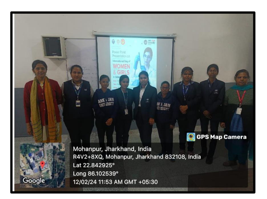
FIG 4: GROUP PHOTO