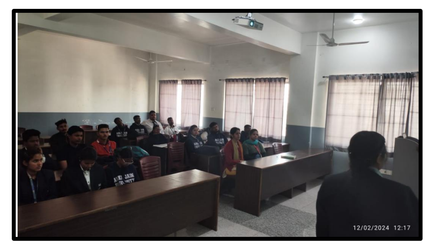
FIG 3: SESSION GOING ON