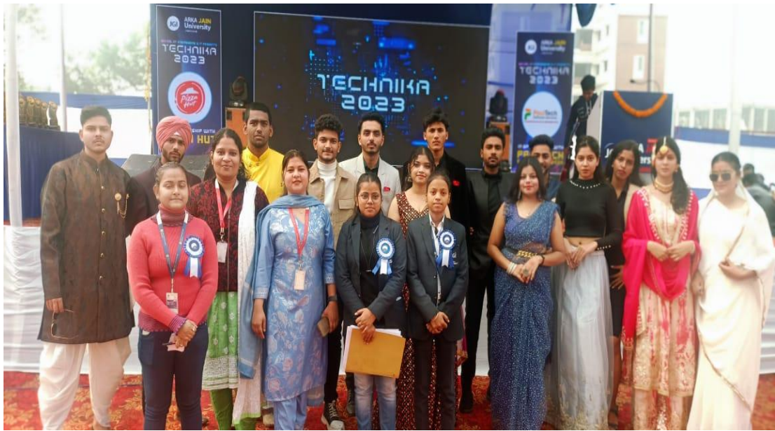
Fig 1: Group Photo