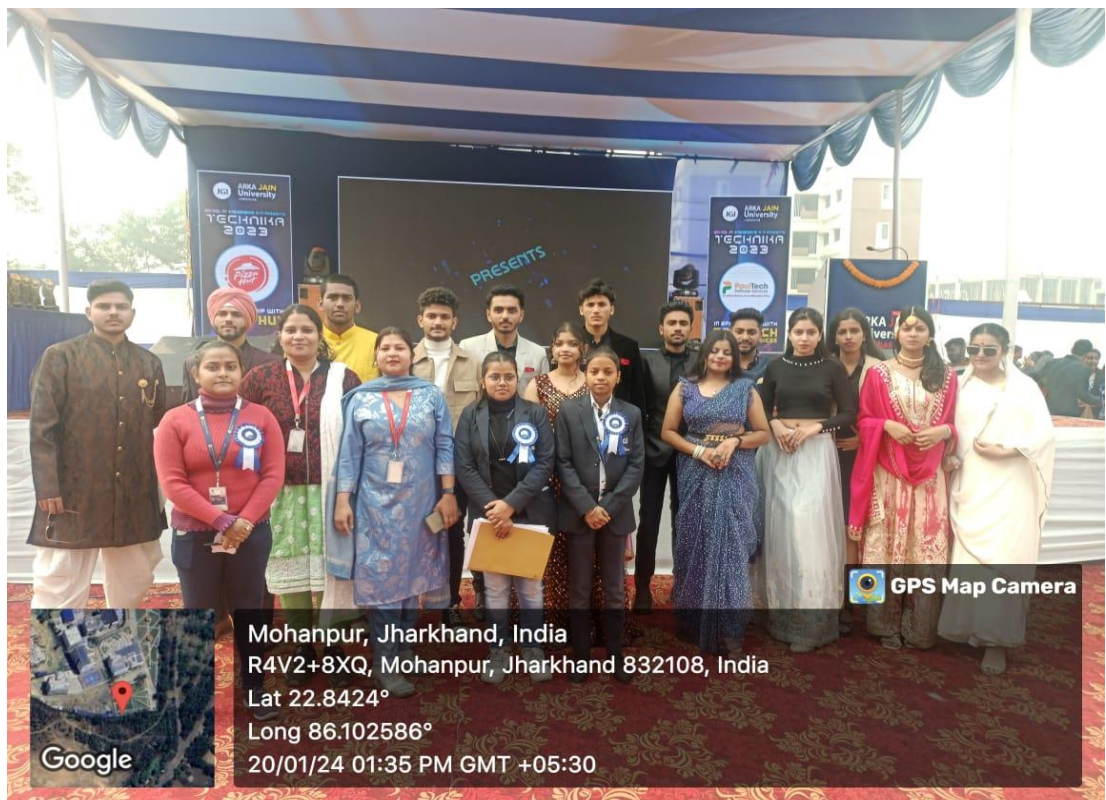
Fig 2: Group Photo