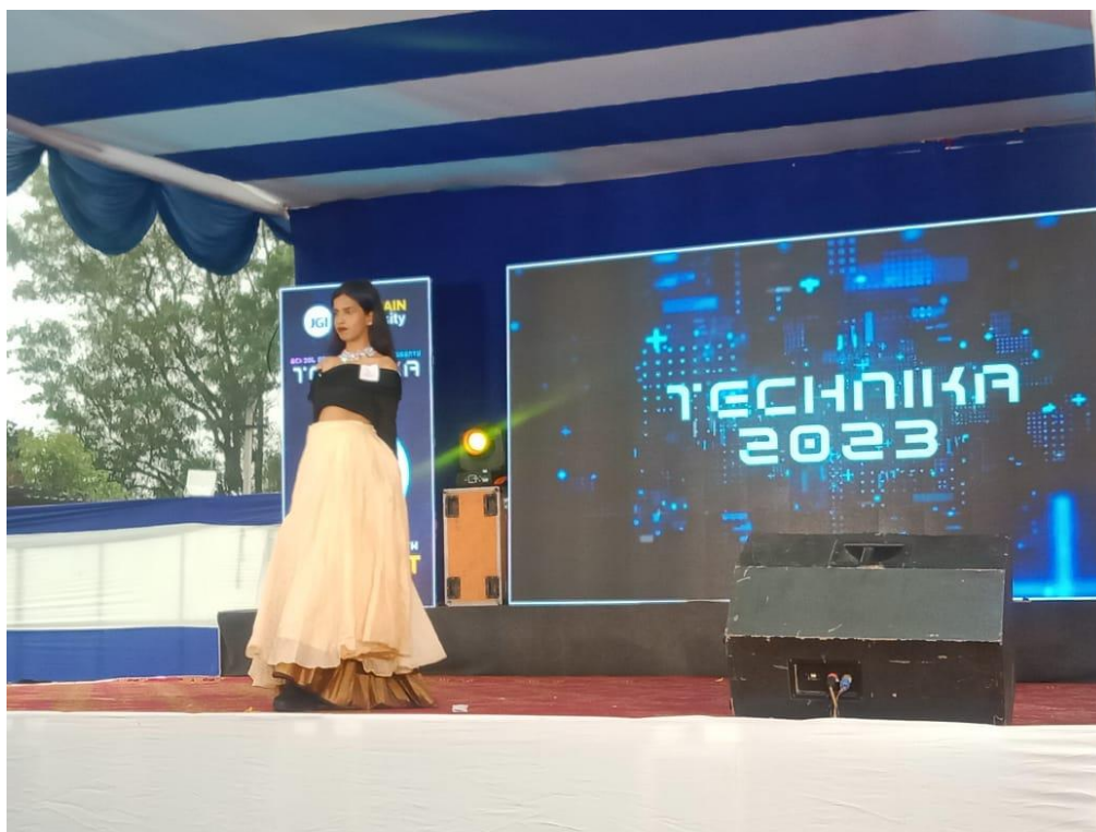
Fig 4: Students showcase their confidence, enthusiasm, and personal style