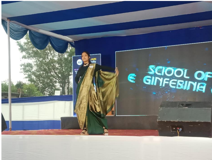
Fig 3: Students showcase their confidence, enthusiasm, and personal style