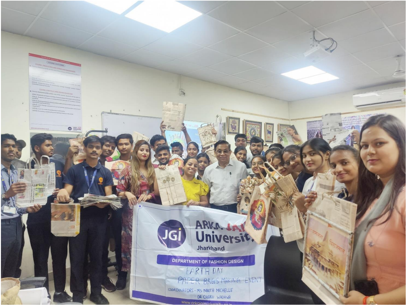
The final group picture with the students, faculties and Guest of Honour