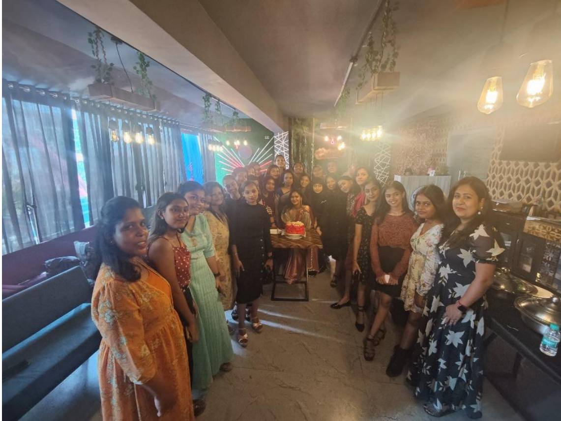
The final group picture with the student designers and faculties