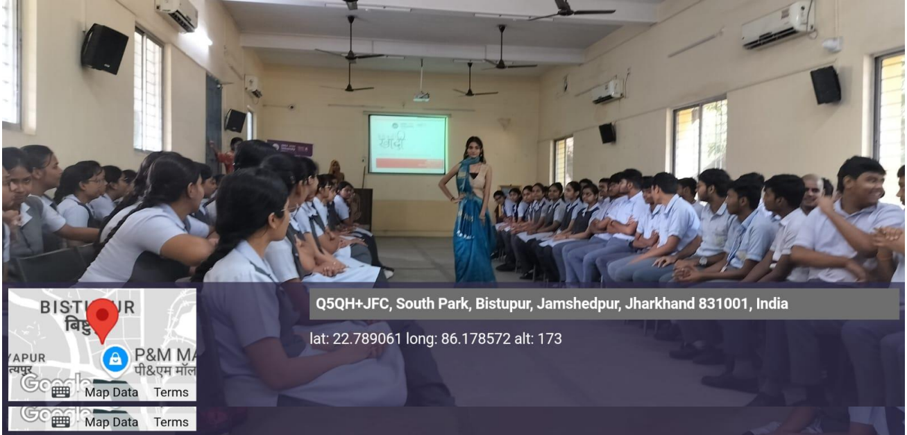
Students of the School enjoying the Fashion Show