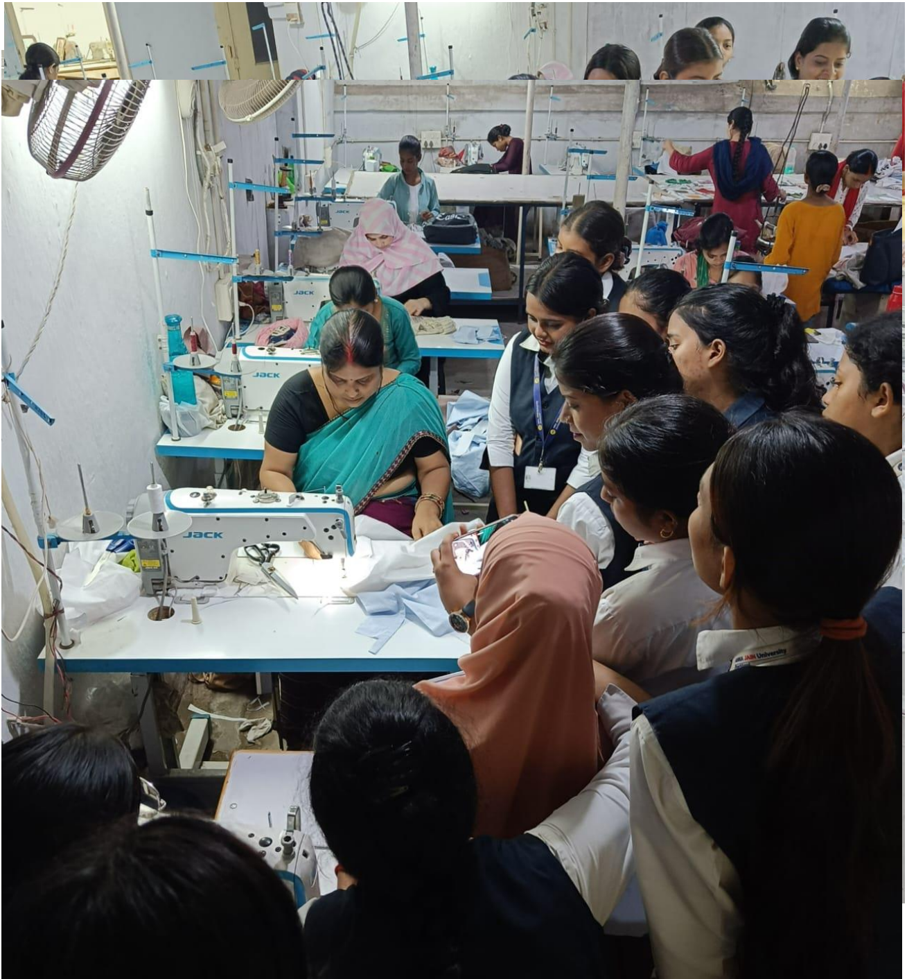
File samples created during the raining programme at Khadi Shirt manufacturing unit