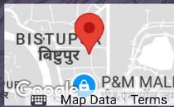
G-36, O Rd, South Park, Bistupur, Jamshedpur, Jharkhand 831001, India