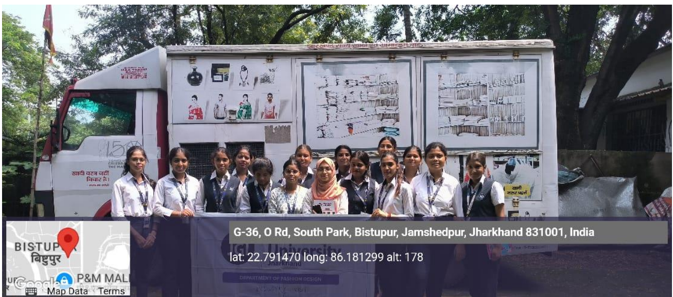
Outside the Khadi Shirt Manufacturing Unit, Bistupur; (below) with the promotional kiosk vehicle