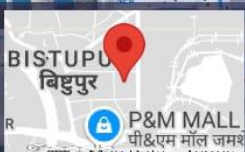
H-2/16, O Rd, South Park, Bistupur, Jamshedpur, Jharkhand 831001, India