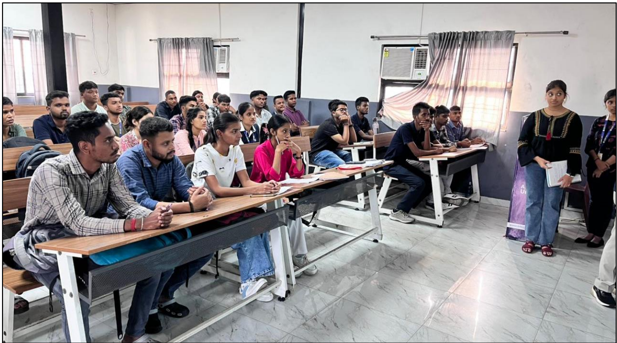
Students audience at seminar