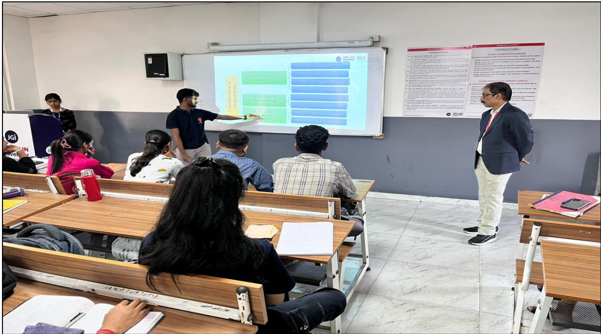
Student presenting in the seminar