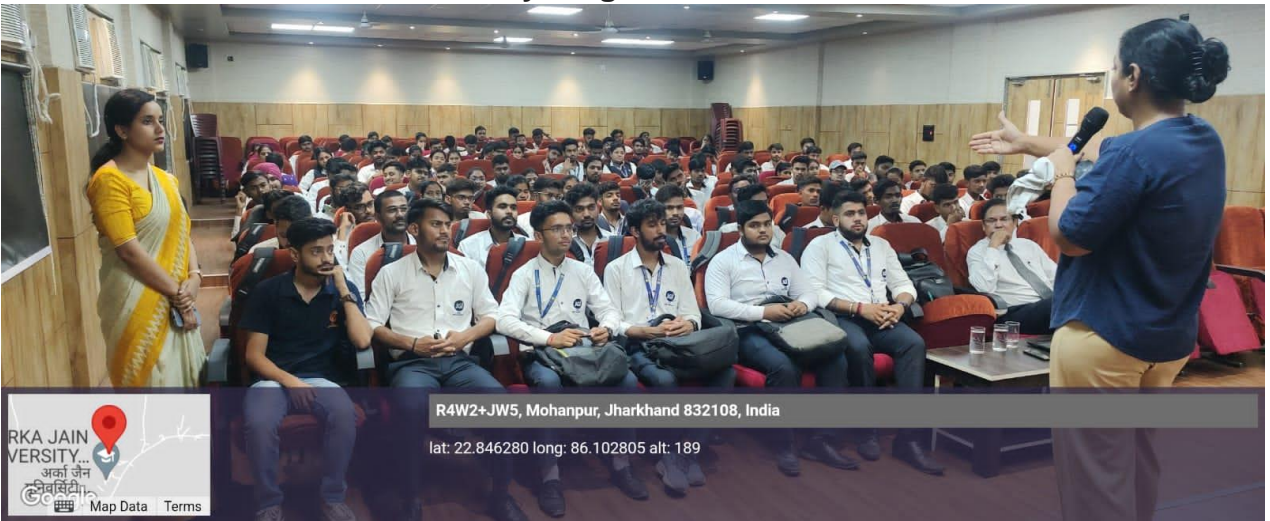
Figure 3: Photo of 3-Day Skill based Workshop of NISM (SEBI)- Financial Education of young citizens