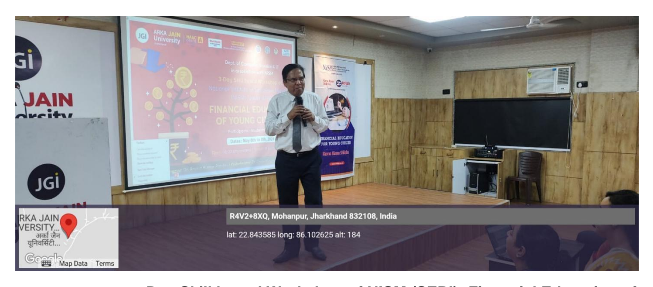
Figure 2: Photo of 3-Day Skill based Workshop of NISM (SEBI)- Financial Education of young citizens