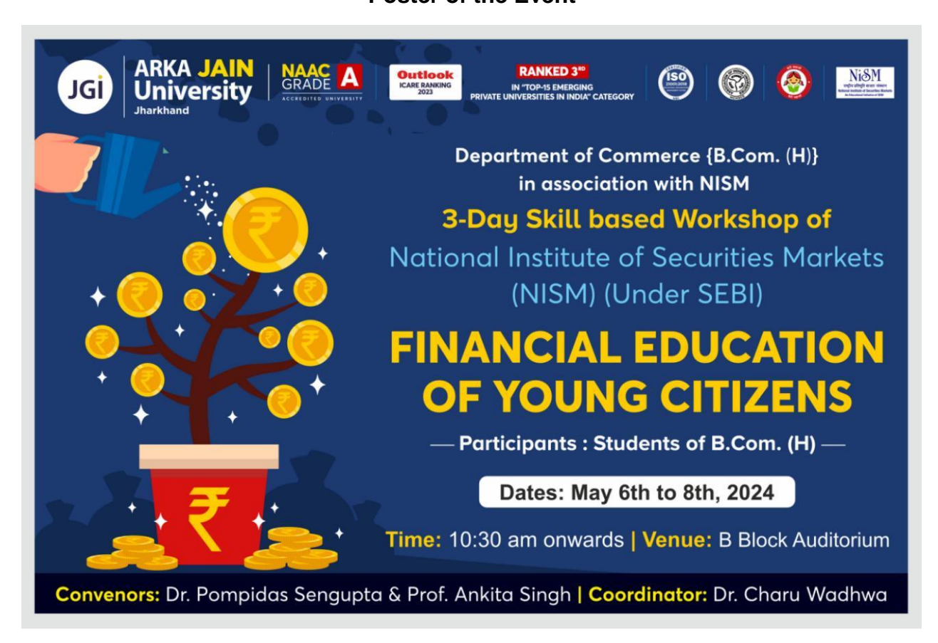
Figure 1: Poster of 3-Day Skill based Workshop of NISM (SEBI)- Financial Education of young citizens