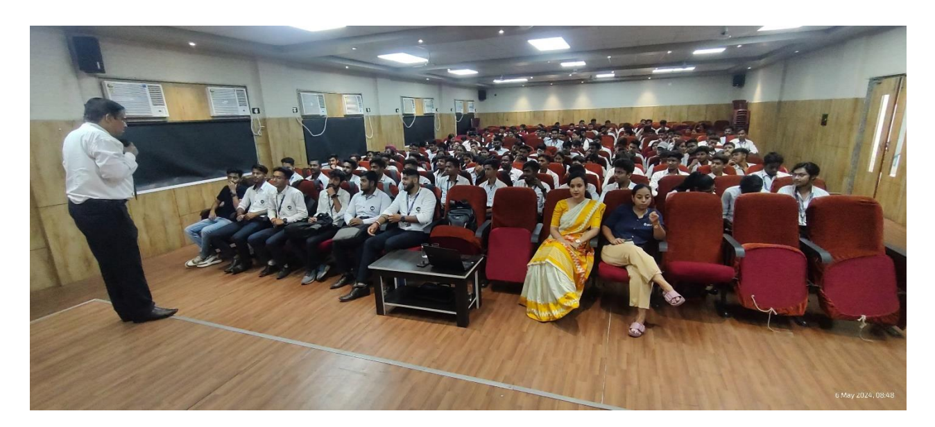
Figure 5: Photo of 3-Day Skill based Workshop of NISM (SEBI)- Financial Education of young citizens