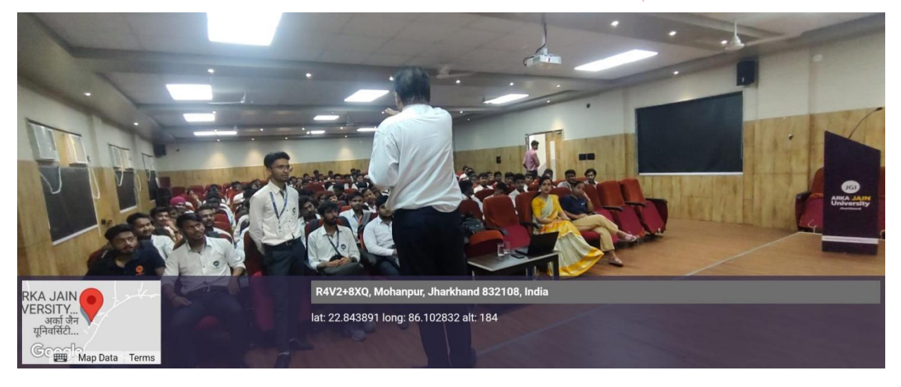
Figure 4: Photo of 3-Day Skill based Workshop of NISM (SEBI)- Financial Education of young citizens