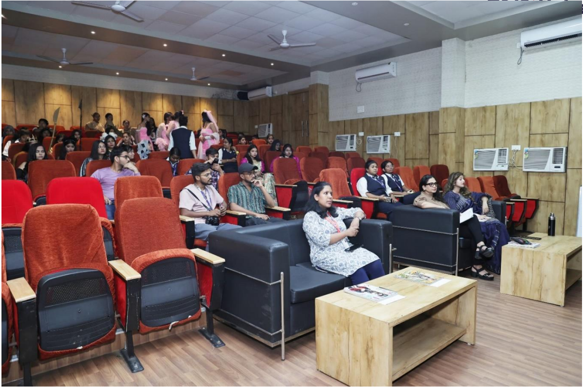
Figure 3. Audience seated at the JEH Auditorium for the Design Collection Jury