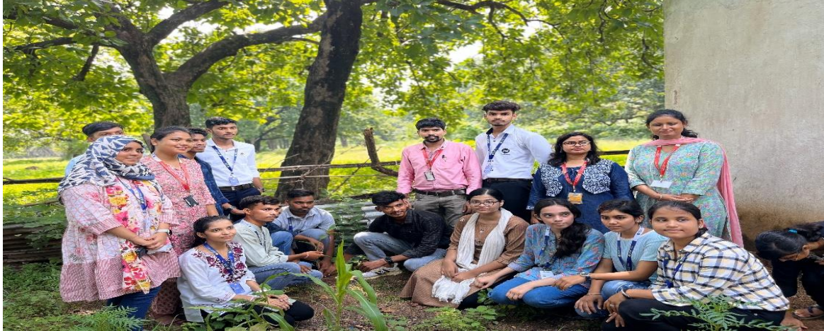
Students are seeding in the schoolyard of Musri Kudar