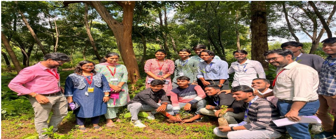
The group of students in the village of Musri Kudar