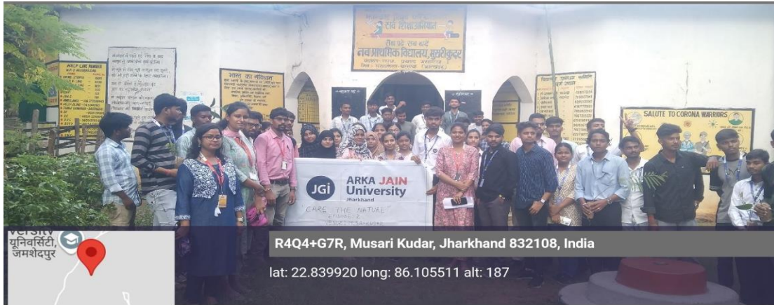
The group of students in the primary school of Musrikudar