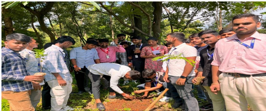
Students are seeding in the Villaae of Musri Kudar