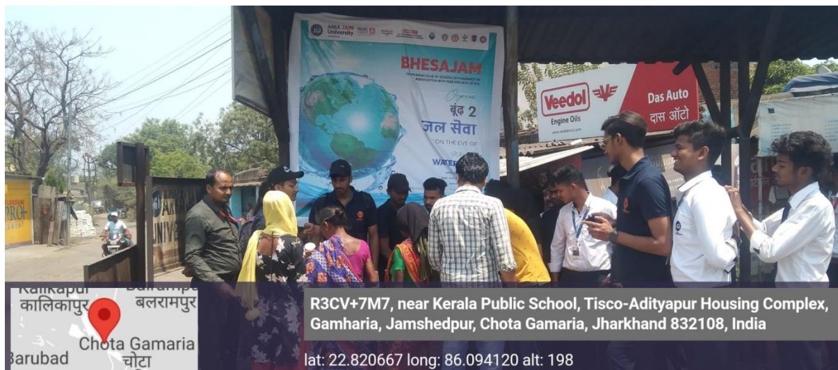
Common people eagerly wait for their chance to beat the heat with a splash of lemonade