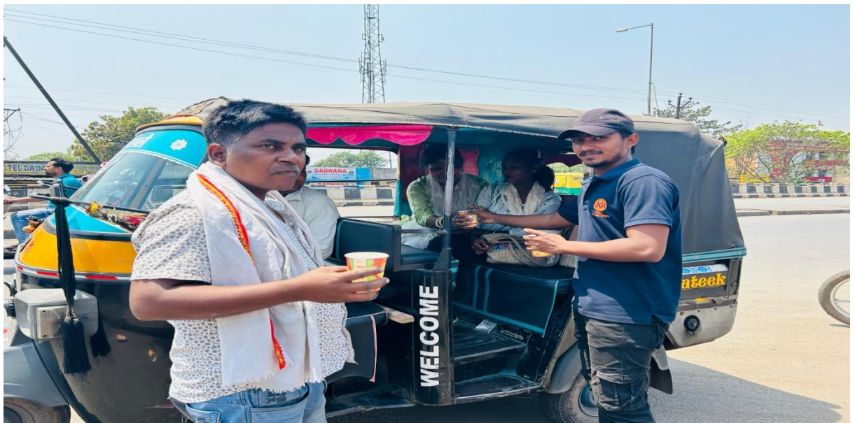
Students distributing Lemonade among the Taxi driver who are working in this summer heat