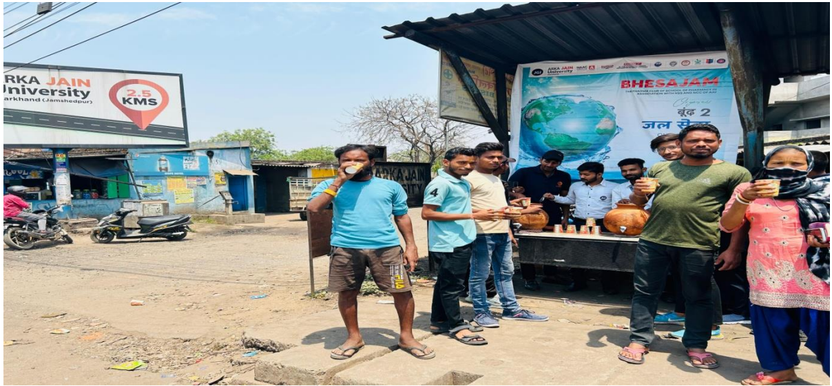
People enjoying the taste of Lemonade