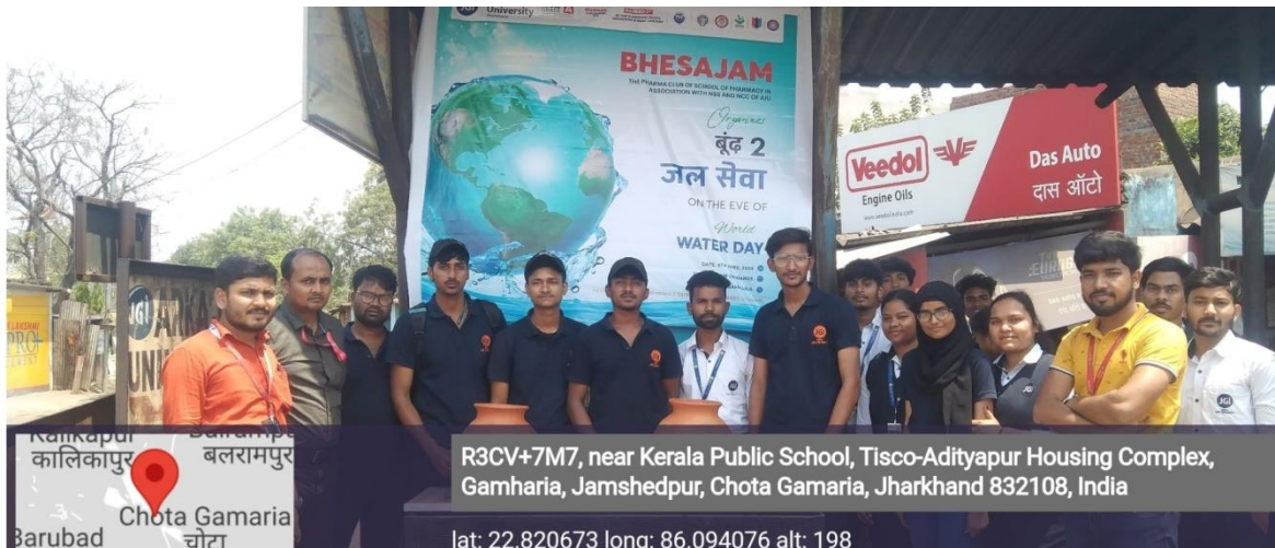
Students and Faculty members ready for Boond 2 at Gamharia