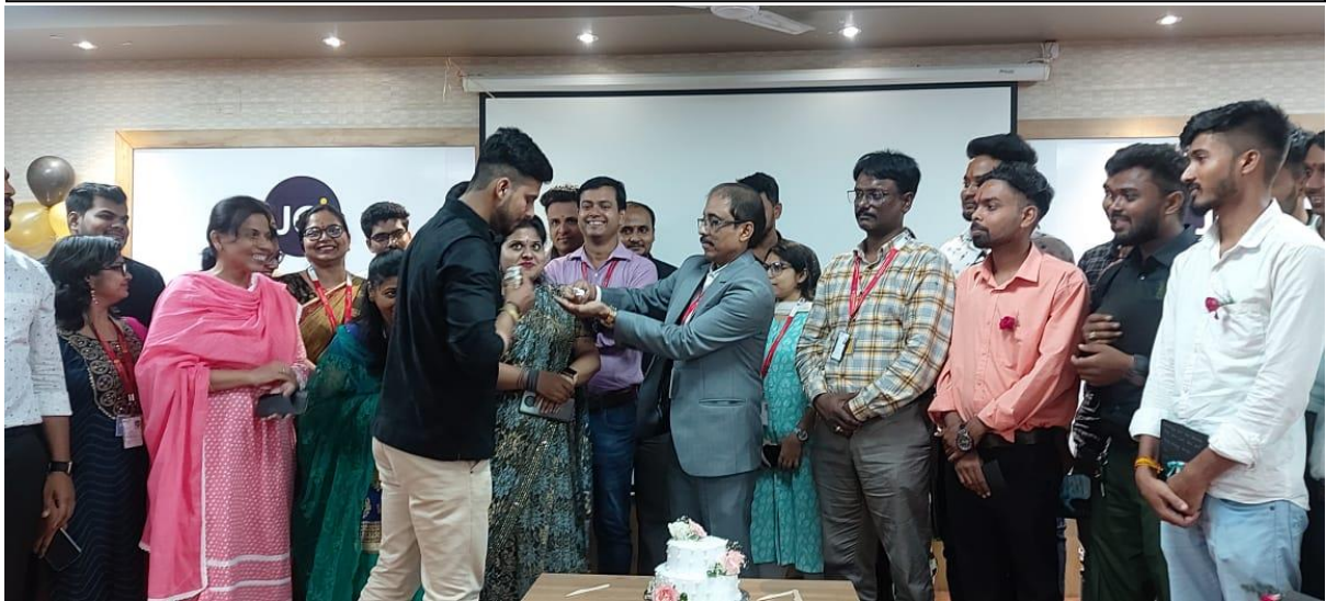
Sharing cake among the students