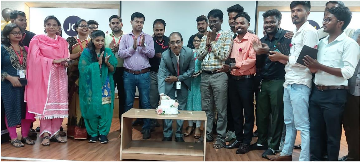
Inauguration of RUKHASAT 2023 with cake cutting