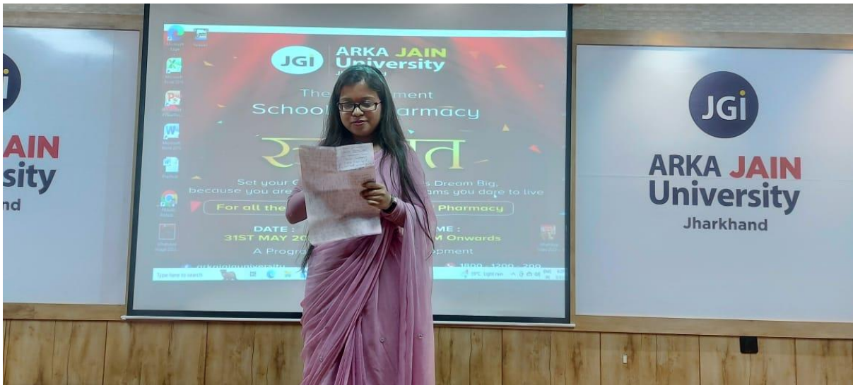
Sharing the feelings