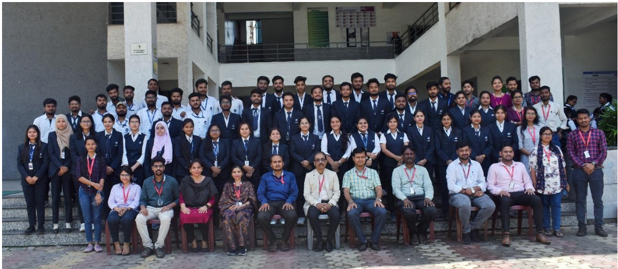
The Golden Batch B. Pharm 2019