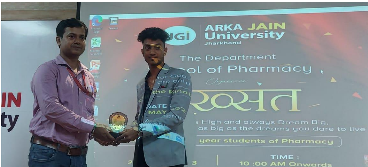
You are one of a kind