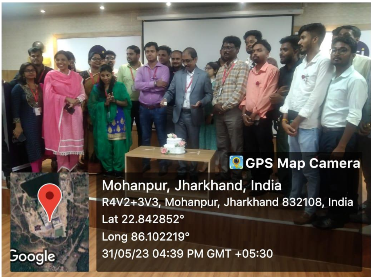
RUKHSAT 2023 for B. Pharm 2019 admission batch students