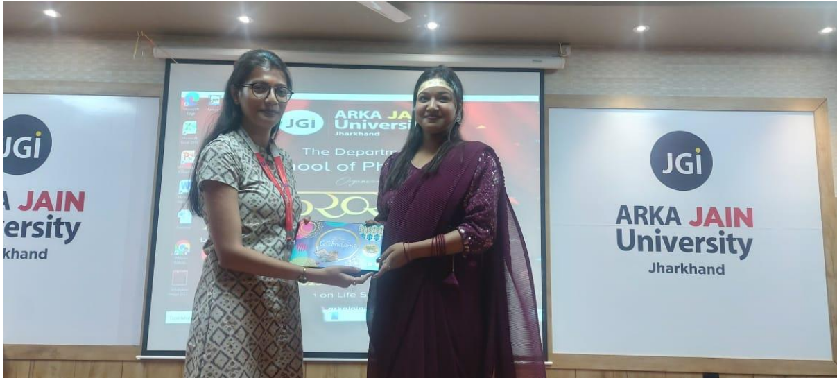
You all are the priceless pearls of School of Pharmacy