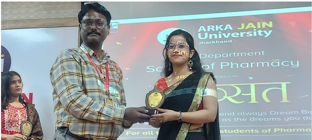
Rather you people make us proud