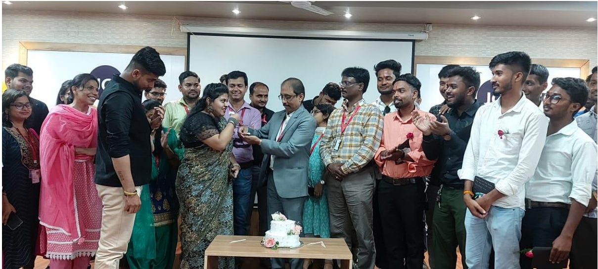
Students you always remain close to our heart