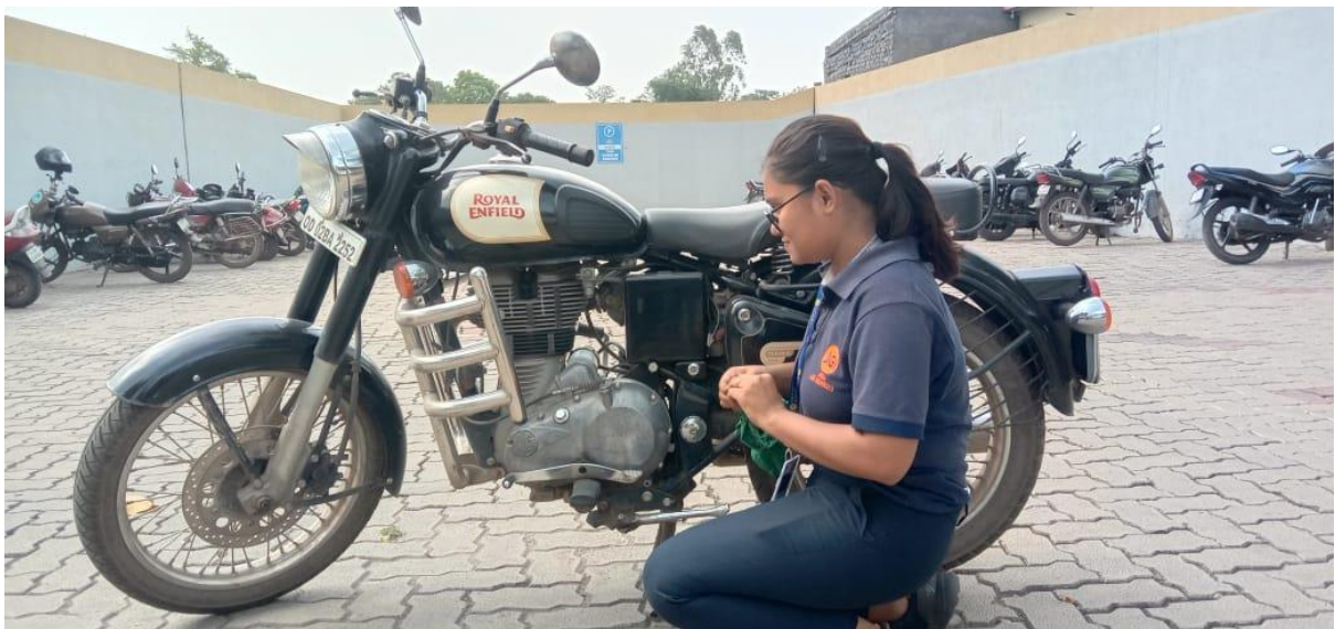
Mechanical skill of performance of a girl student