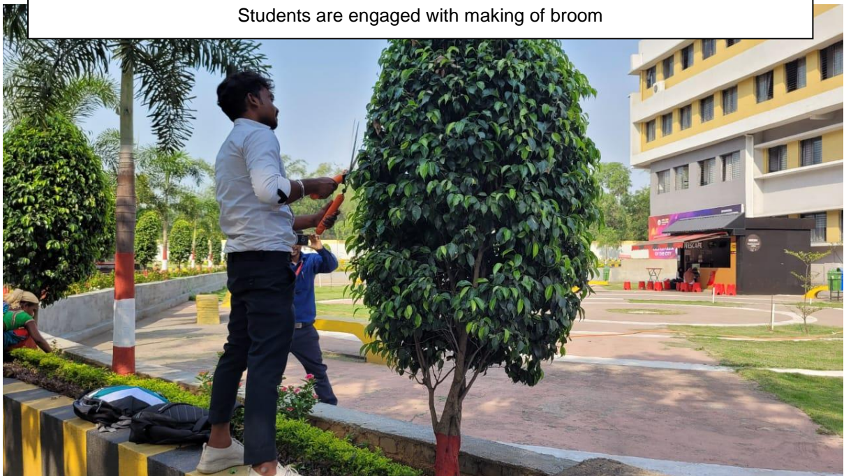
Student engaged in trimming a plant