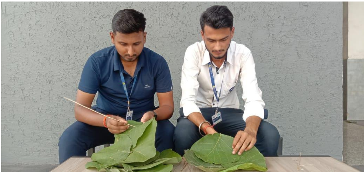
Students are engaged in stitching leaf plates