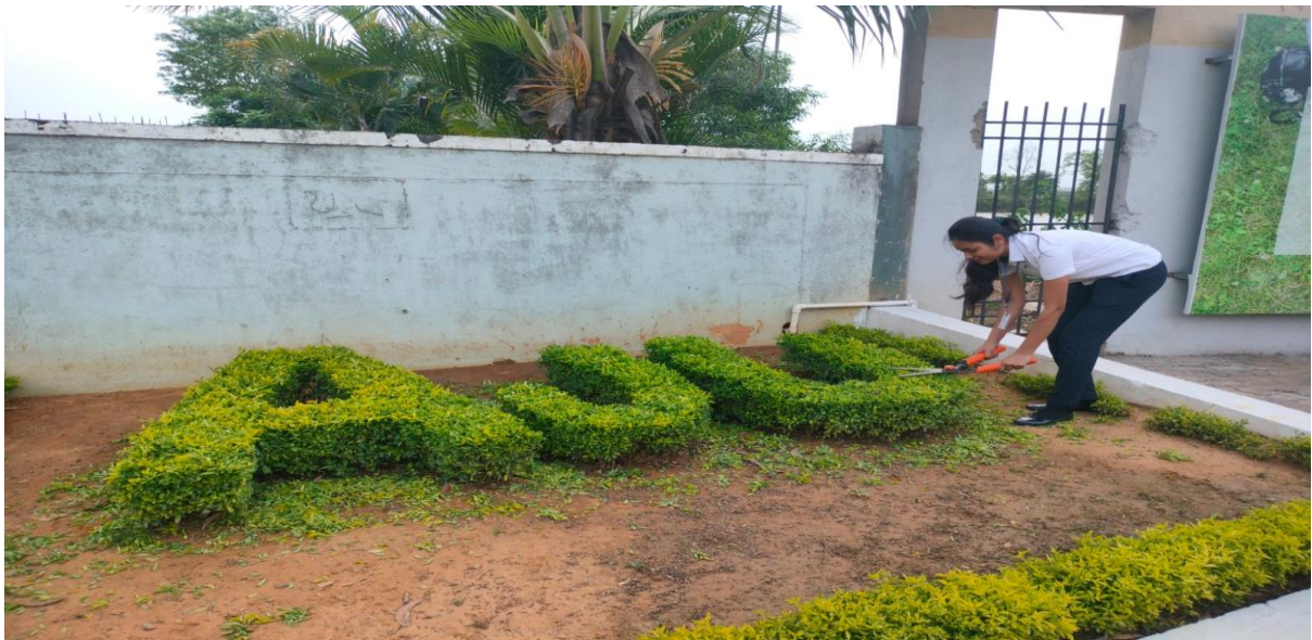
Even Girls are expert in lawn making