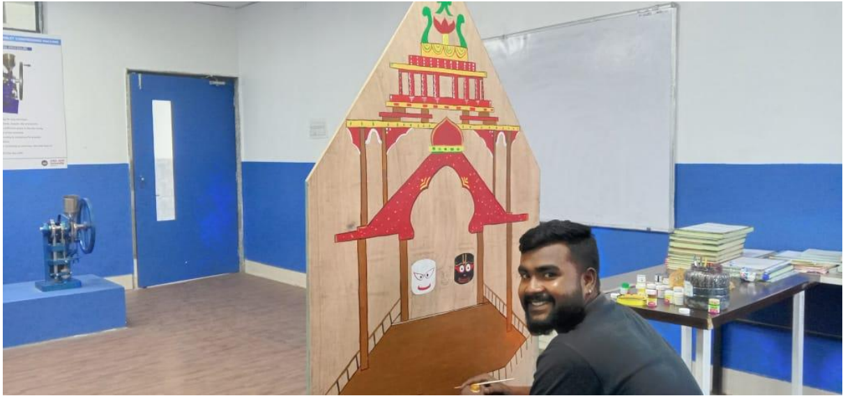
Painting a chariot