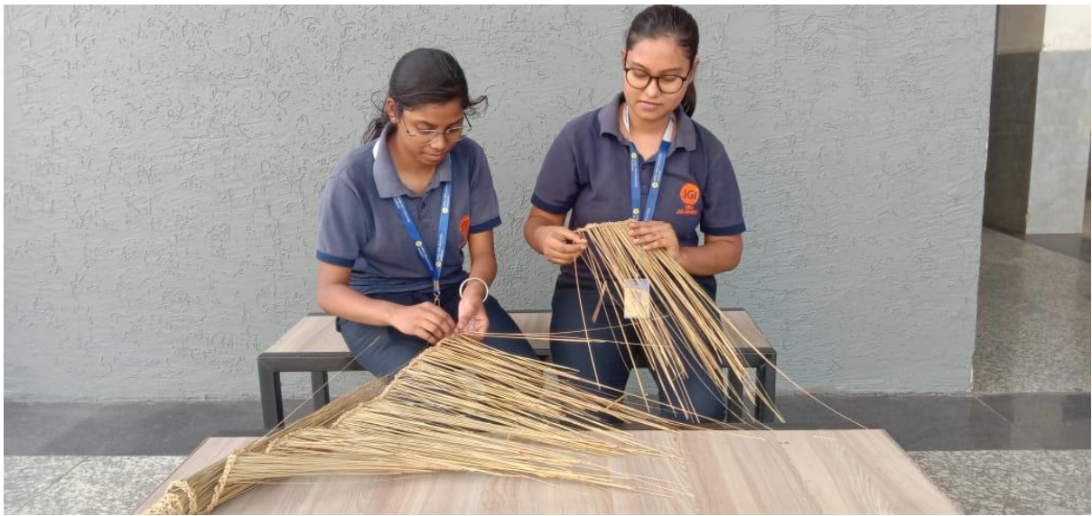
Students are engaged with making of broom