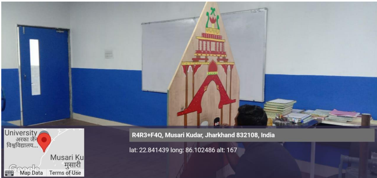
RUPANTARN Episode 1