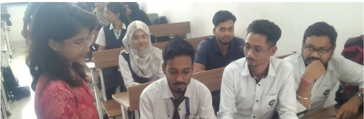
Students actively participating in the quiz competition