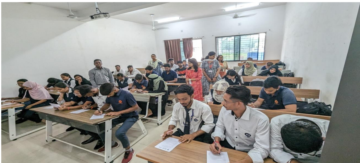
Faculty coordinators vigilantly monitoring the students