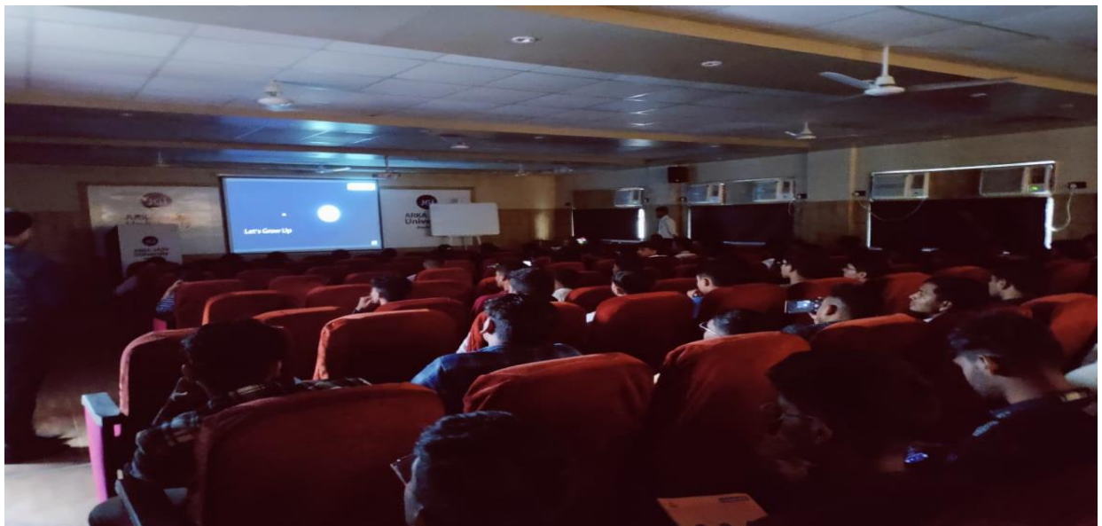
Students watching an insightful video presentation on the occasion of National Space Day, celebrating the achievements and advancements in space exploration