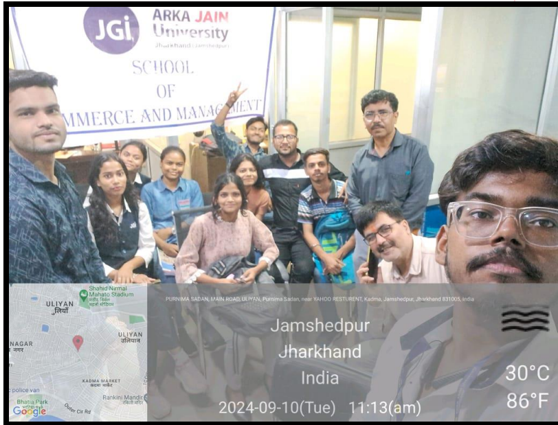
Figure 3: Photo of the Event: Group photo of the students with the Event Coordinator