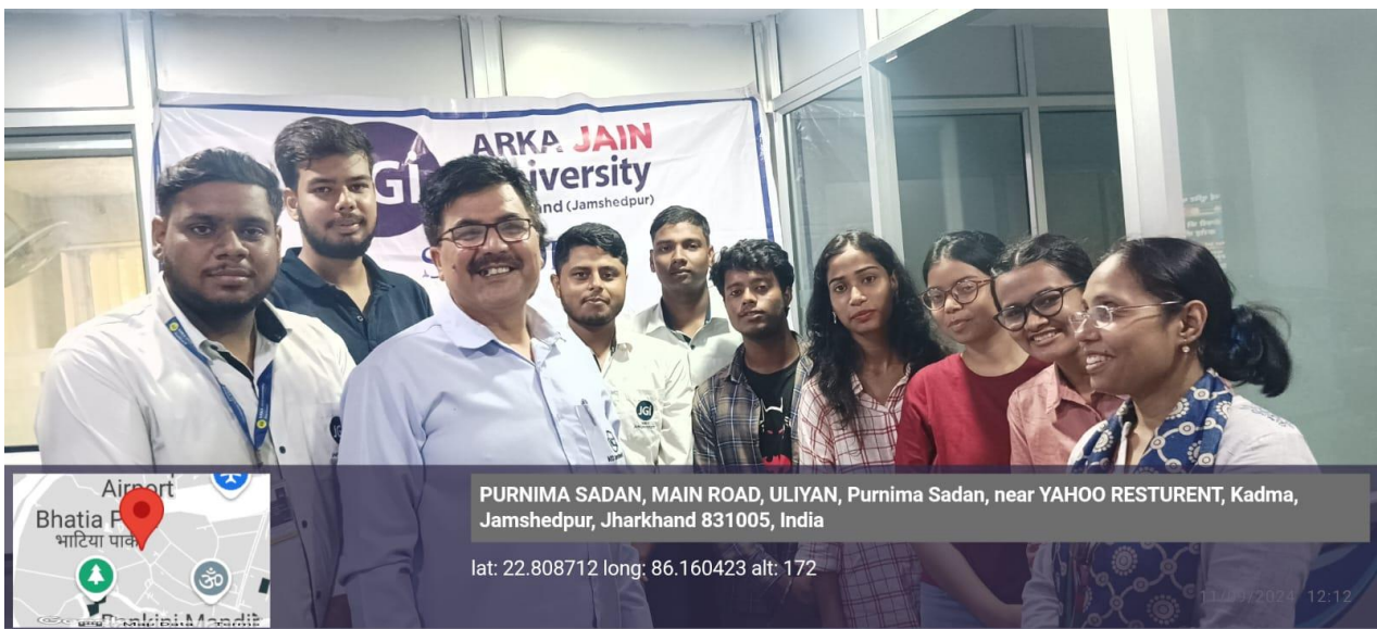
Figure 4: Photo of the Event: Group photo of students