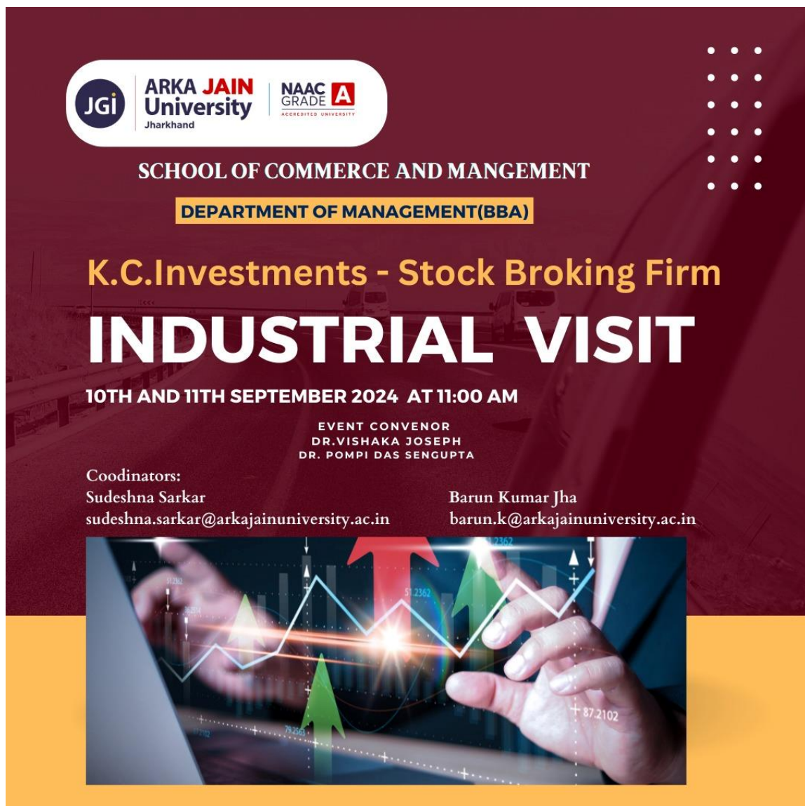
Figure 1:Poster of the Event: Industrial Visit

TAKEAWAY: The industrial visit equipped students with practical knowledge of fundamental and technical analysis, provided guidance on how to start trading, and offered insights into building a successful career in the stock market.