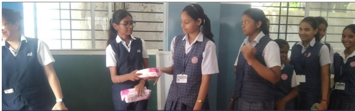
Faculty Members & Students volunteers of School of Pharmacy, ARKA JAIN University at Vidya Jyoti School, Gamaharia For Feminine Hygiene IV