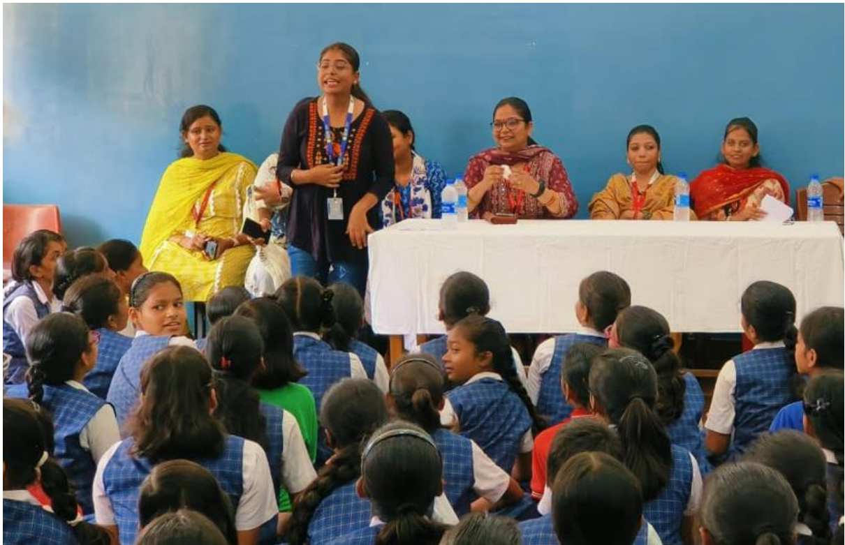
Volunteers of Bhasajam club interactions with students of Vidya Jyoti School, Gamaharia