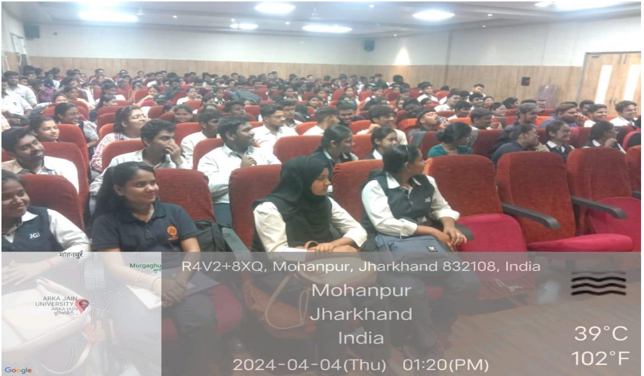
Figure2: Photos of the Event