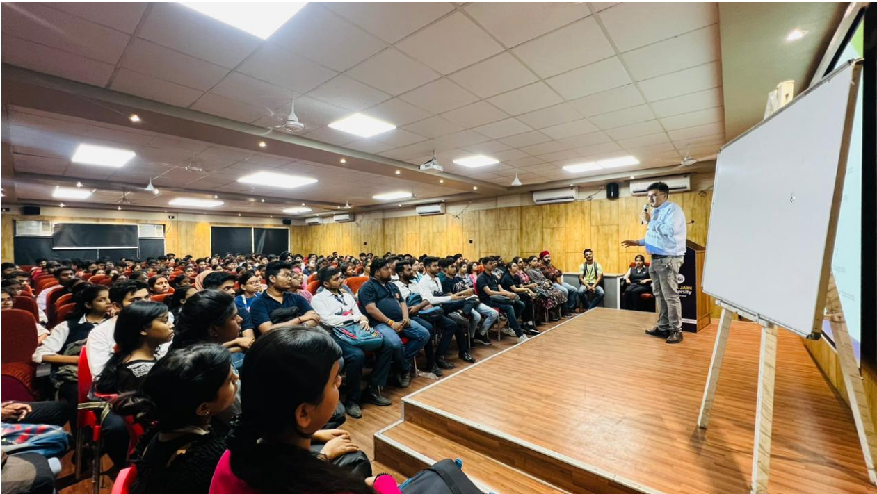
Figure 3: Photos of the event