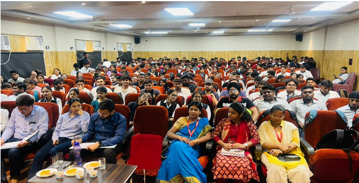
Figure 4: Group Photograph