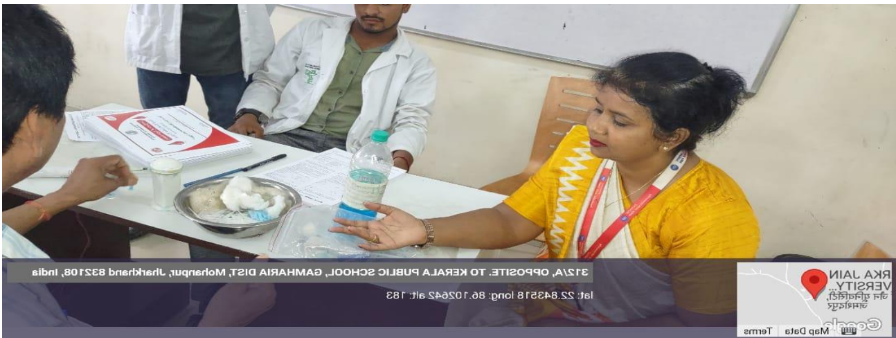
Figure 2 : Blood donation eligibility testing by experts