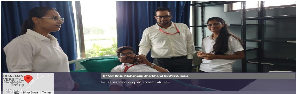
Figure 1: Blood donation by faculties