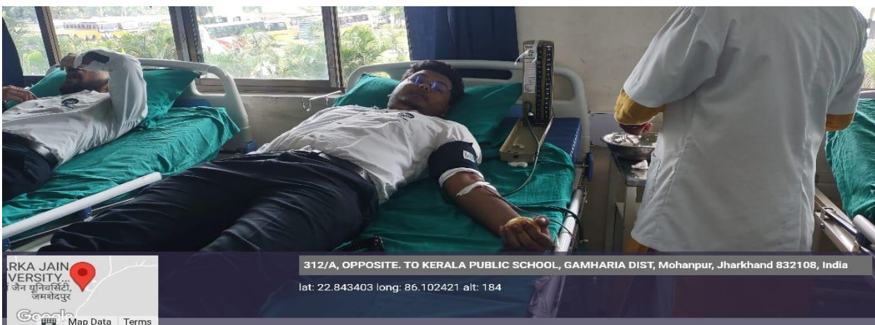
Figure 3: Blood Donation by students