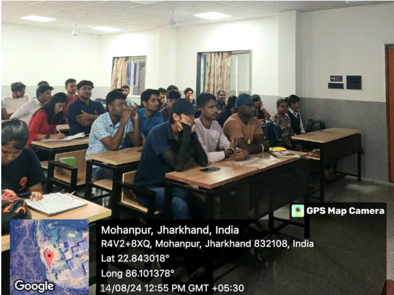
Fig 1: Awareness session on Anti Ragging