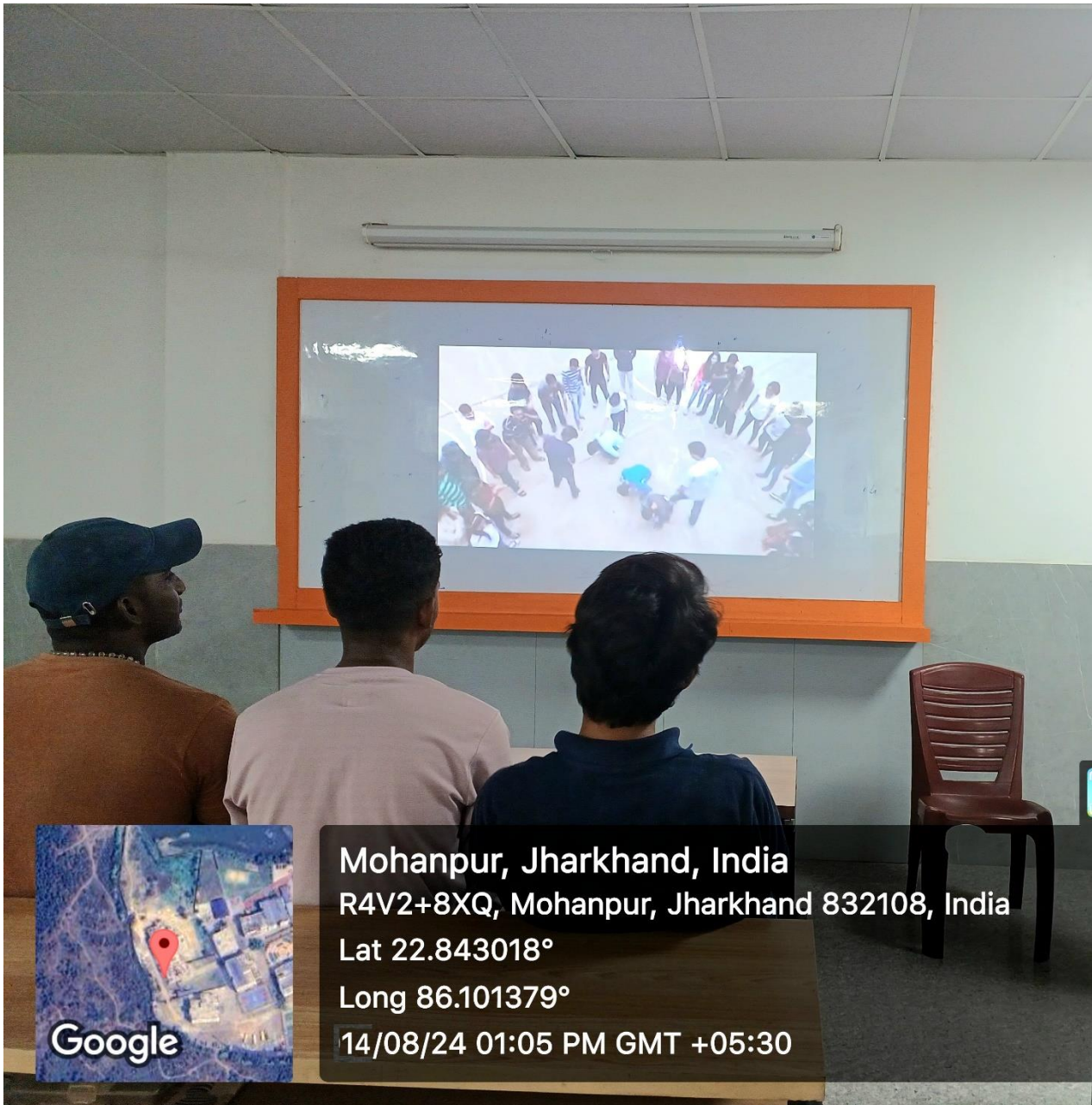
Fig 2: Anti ragging Documentary Video clip