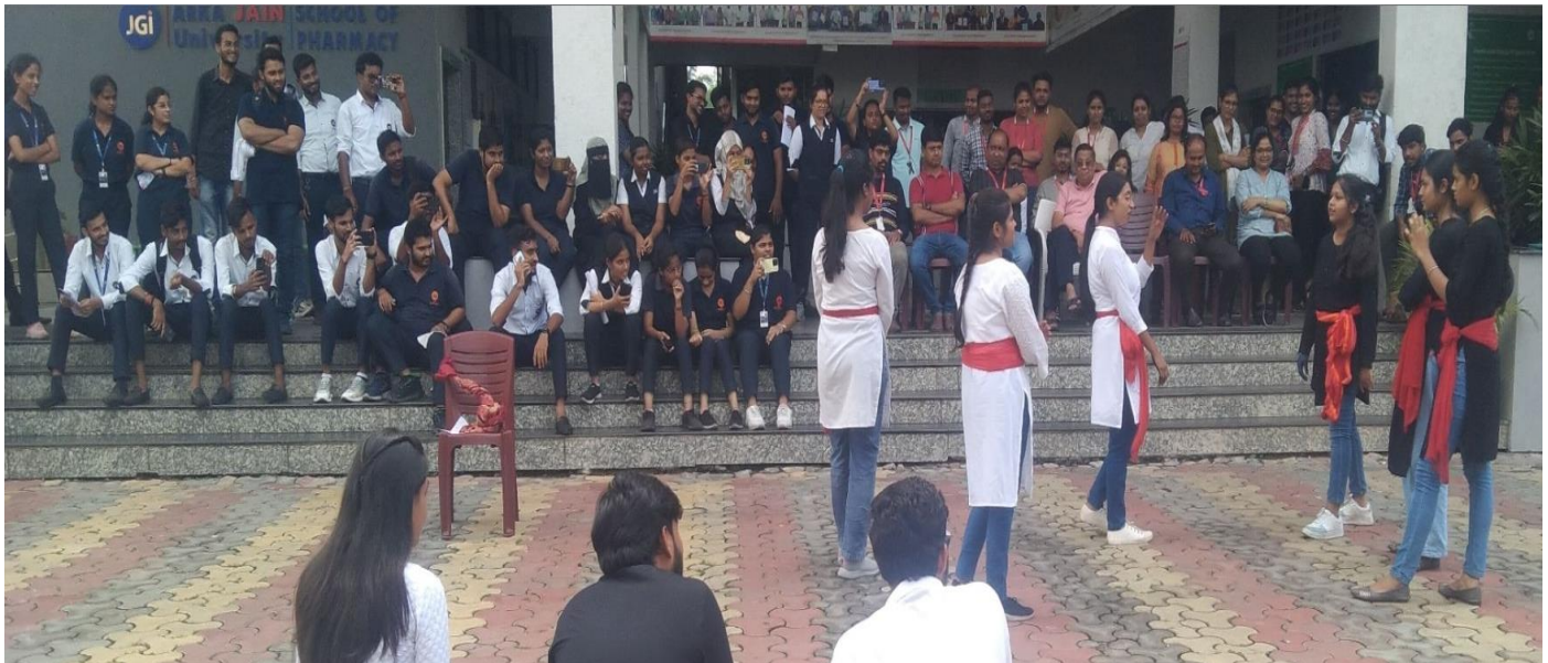
An emotional portrayal by students, reinforcing the message of empathy and solidarity in the fight against ragging