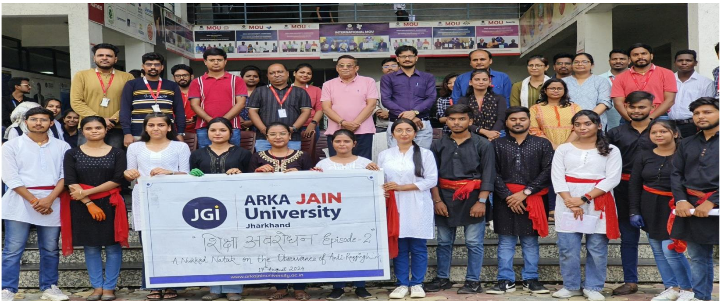
Nukkad Natak team with the Faculty members of School of Pharmacy, ARKA JAIN University