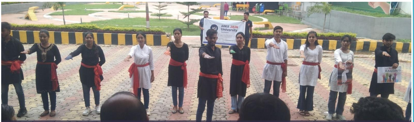
Students deliver a strong performance, highlighting the importance of standing against ragging and ensuring a safe campus for all