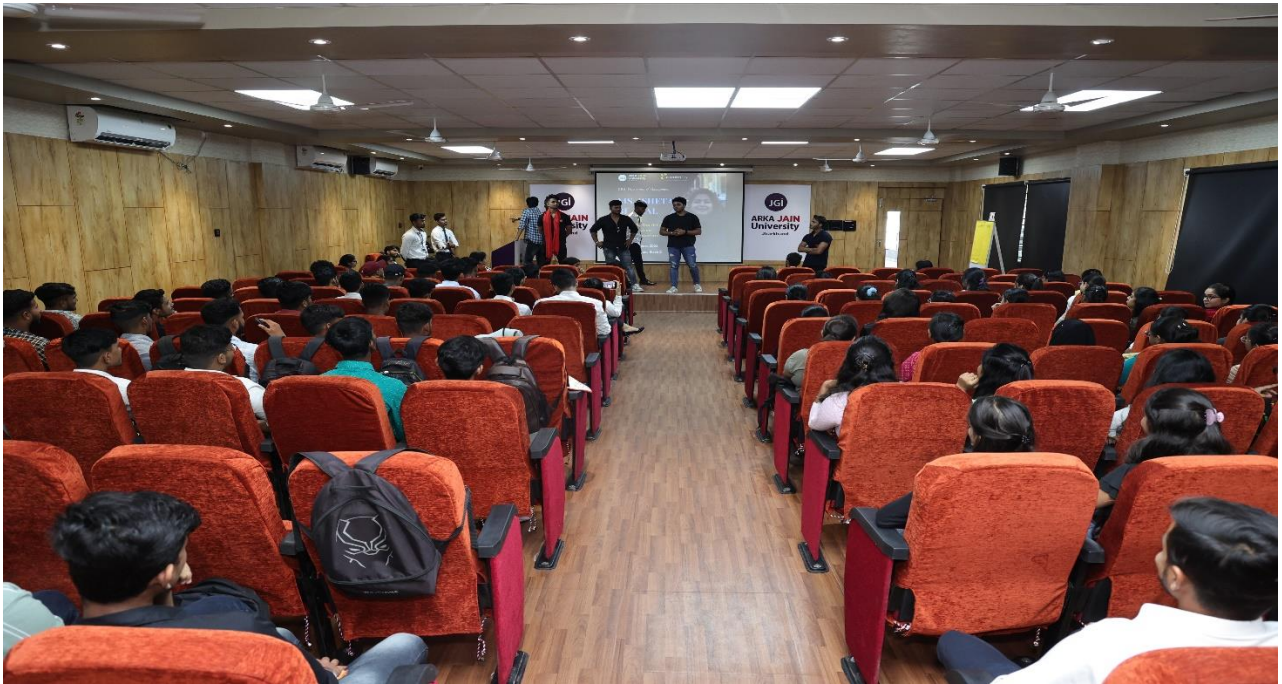
Fig 3: Photo during Session