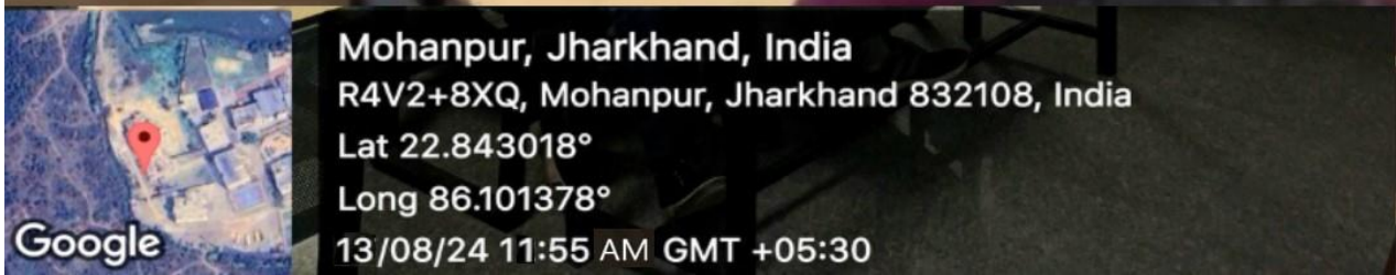
Fig 2: Geo Tag Photo