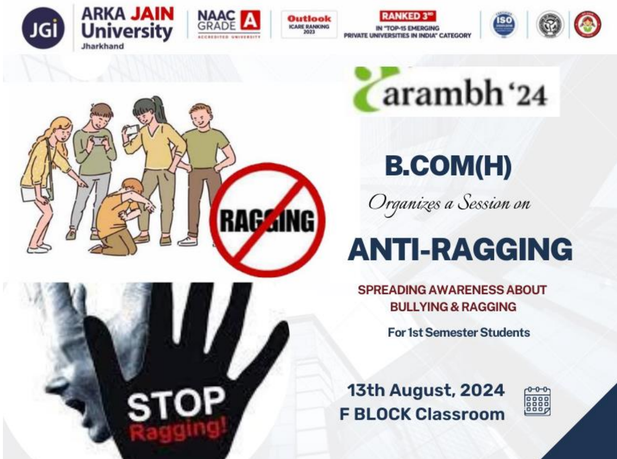
Fig 1: Poster of the Event