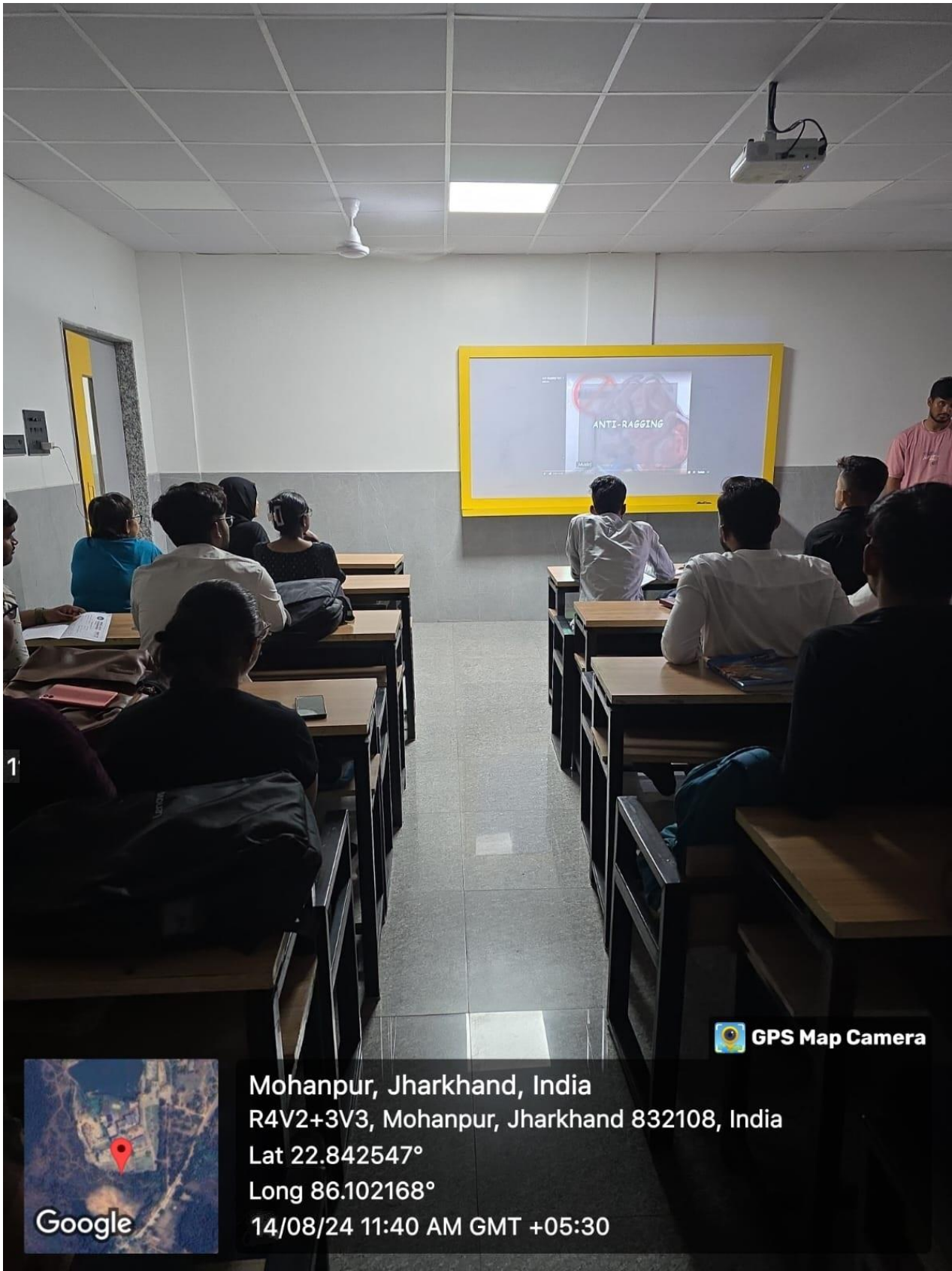
Fig 3: Photo During Session