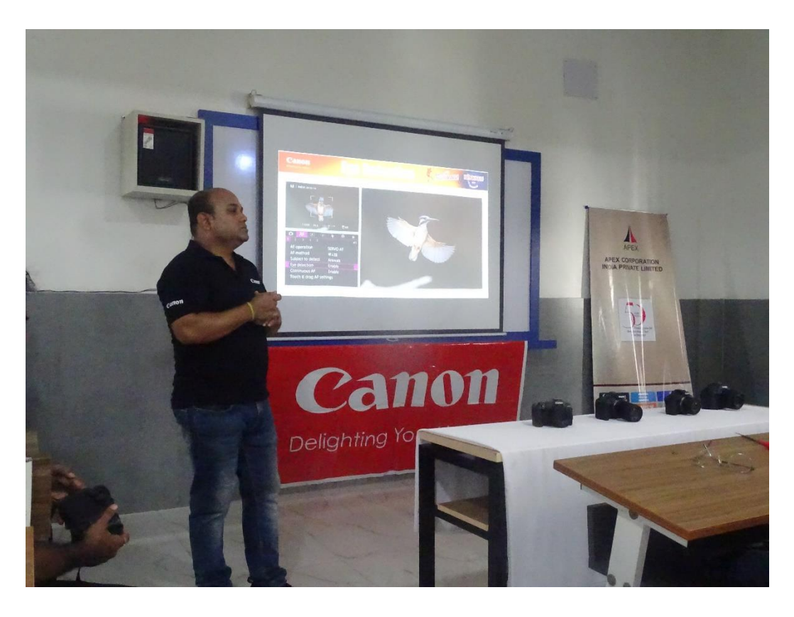
Figure 2: The Trainer explaining the concepts to the students