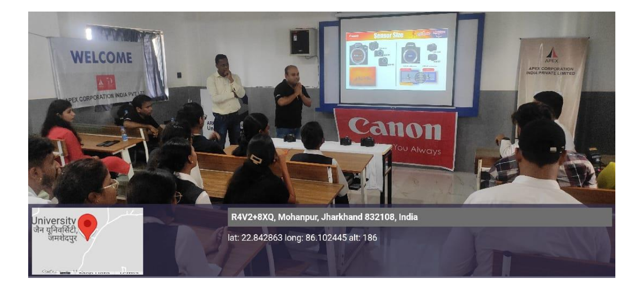
Figure 3: The Trainer addressing the question of the students