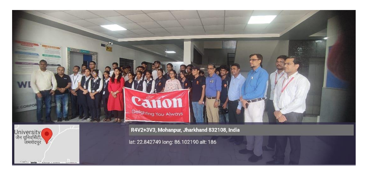
Figure 4: Group Photograph of the students with the trainers and the faculty members