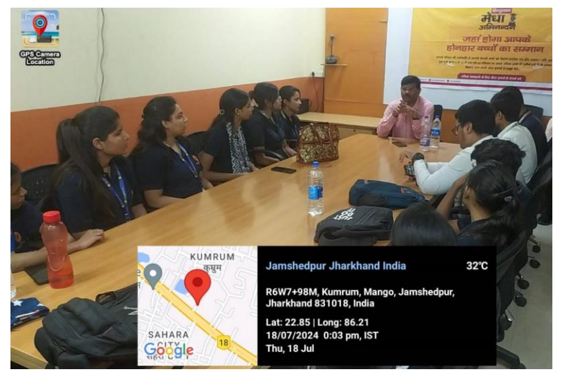
Figure 3: Students getting guidance on career prospects in print media during media industry visit