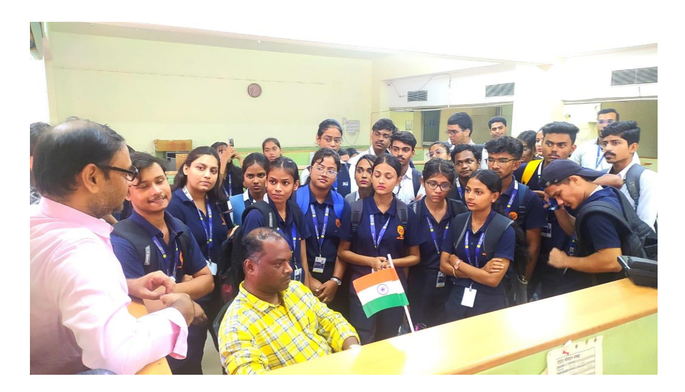
Figure 6: Students getting guidance on news writing during media industry visit