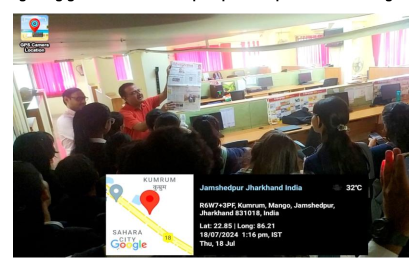
Figure 4: Students getting awareness on advertising and circulation during media industry visit