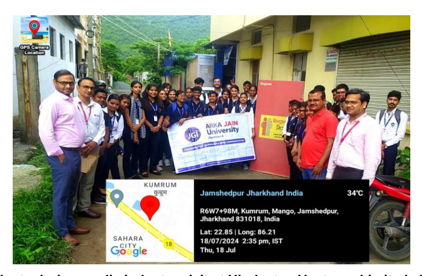
Figure 2: Students during media industry visit at Hindustan Ventures Limited, Jamshedpur