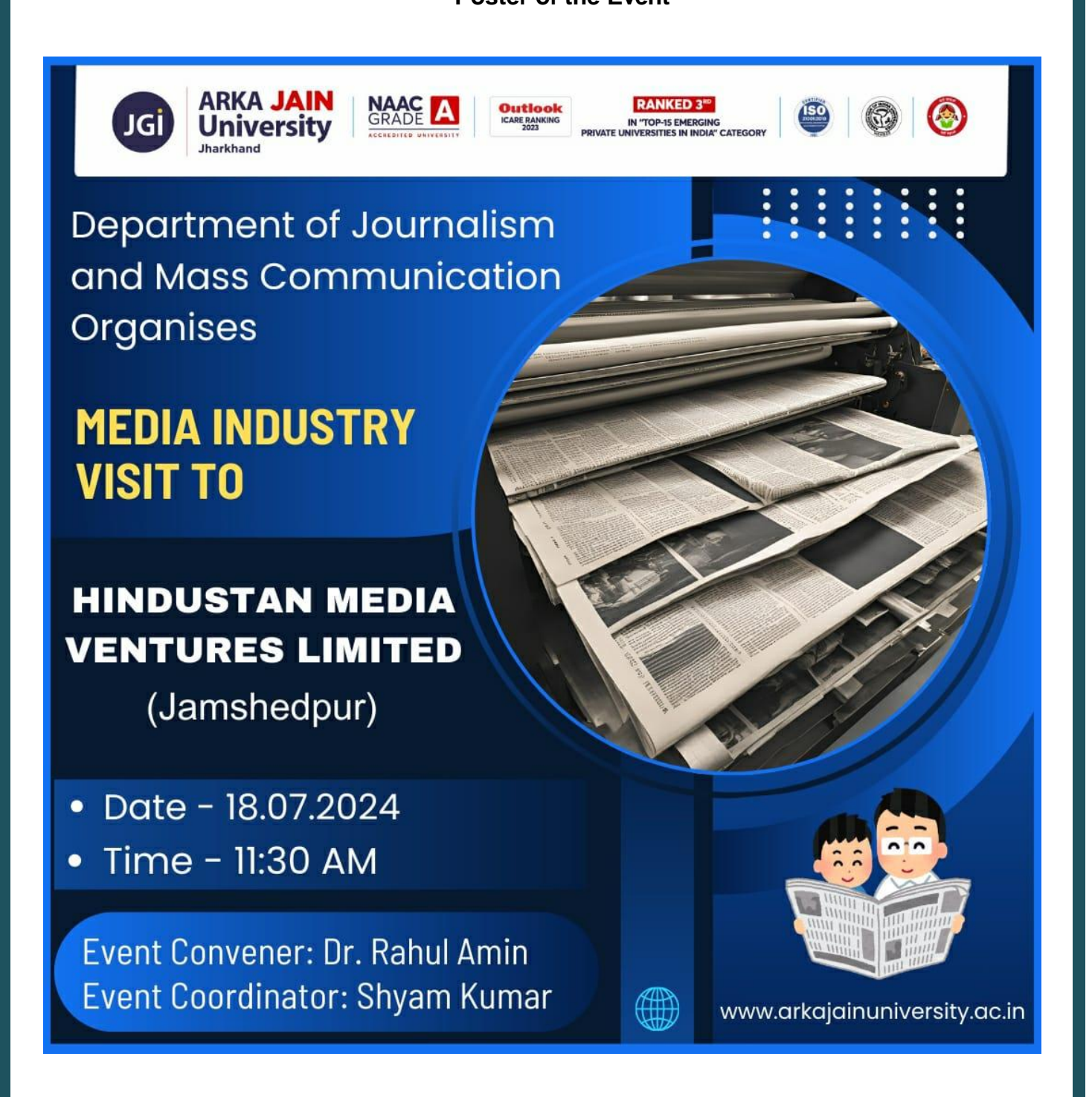
Figure 1: Poster of Media Industry Visit to Hindustan Media Ventures Limited