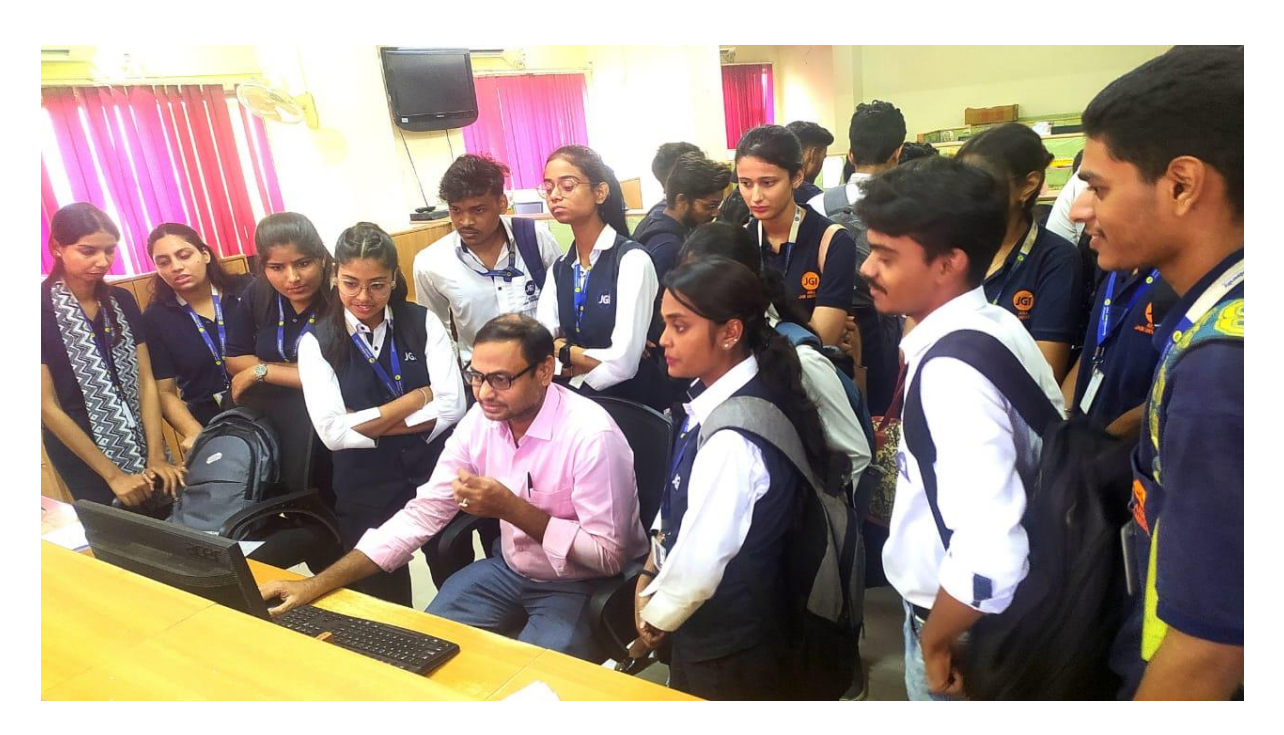
Figure 5: Students getting trained on page designing and news publication during media industry visit